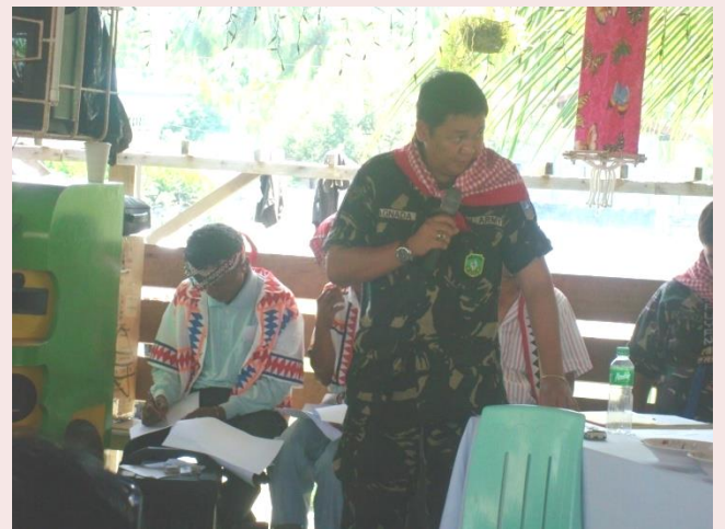
Speech made by the newly adopted higaonons