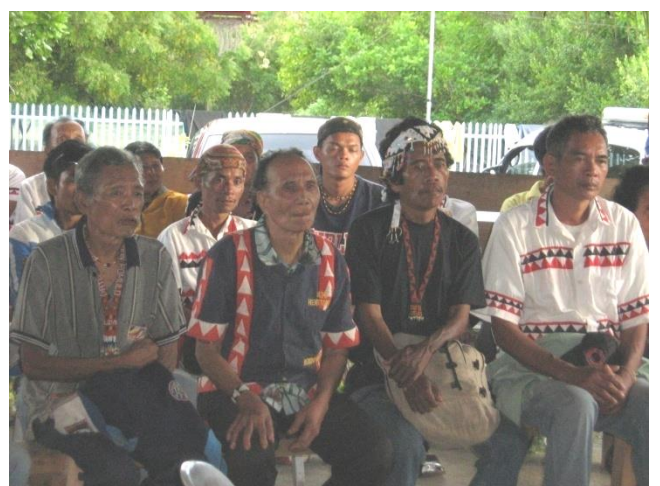
Introduction to the topic KTE (Knowing The Enemy)