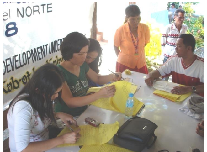
Interview with the victims of the CPP-NPA