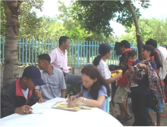
Registration on the morning of the 7 th day of April 2008