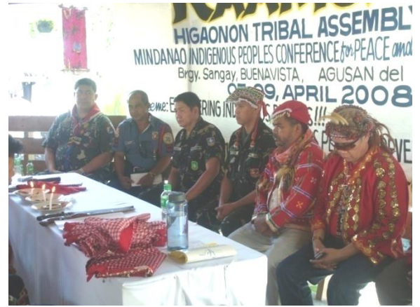
Tribal leaders of the Higaonon tribal assembly during the "begola"