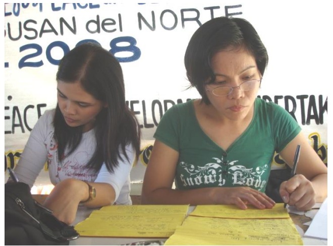
Map tracking exercise for the Higaonons of Agusan del Norte