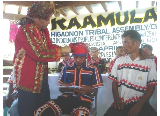
"Tangkulo" a symbol of leadership