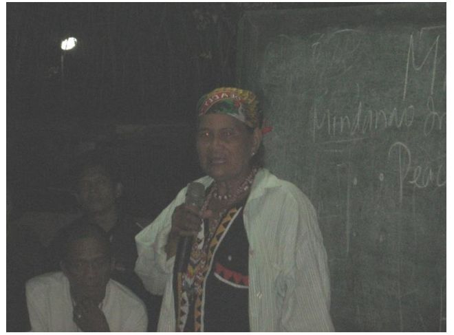
Sharing their stories about their barangay stories.