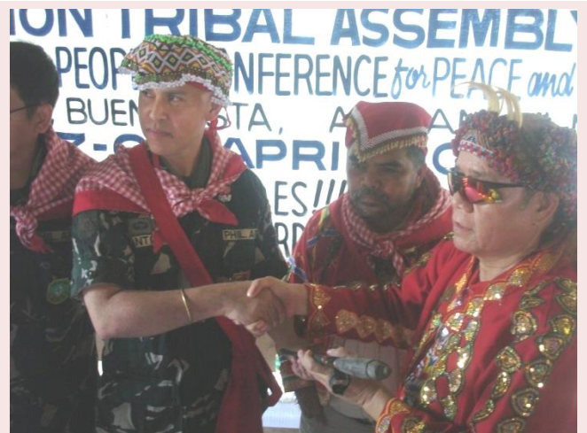
A hand shake seals the pact between this gentleman and tribal leaders