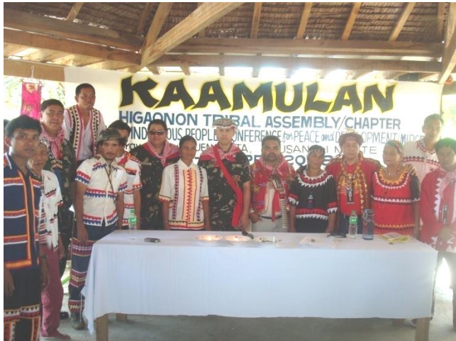
Guest and tribal leaders who are posed for this photo opportunity