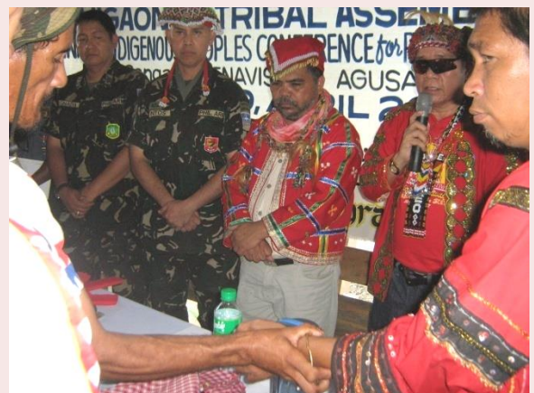
Bracelets are the ornaments placed in the hands of the officers and Datus for the "Begola" as a sign of peace