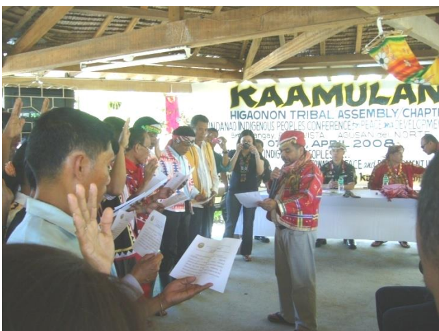
Oath taking of the MIPCPD officials for the local chapter