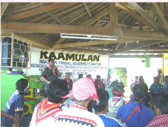
After the gathering the Commanding Officer of Task Force "Gantangan" shares his final words for the tribe.