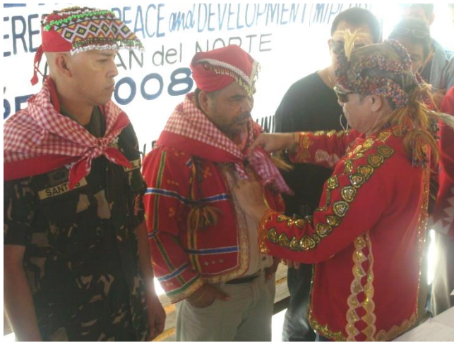
"Tangkulo" are placed for being recognized as a Datu of the tribe, a sign of leadership