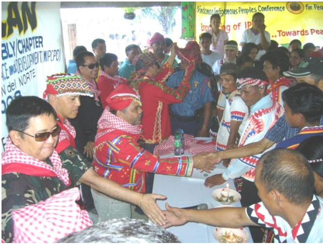
The tribe rejoices as the "begola" or peace pact was agreed upon