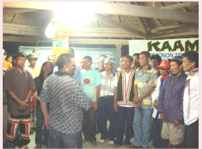
Local chapter members of the MIPCPD election