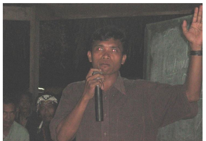
Inspiring the lumads through his life story