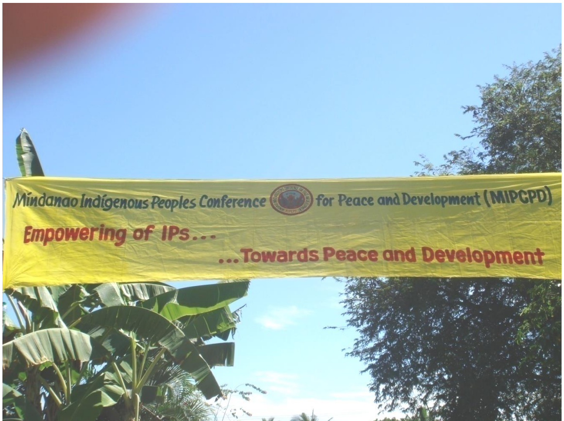
Streamers posted at the entrance of Romero Resort, Brgy. Sangay, Buenavista, Agusan del Norte.