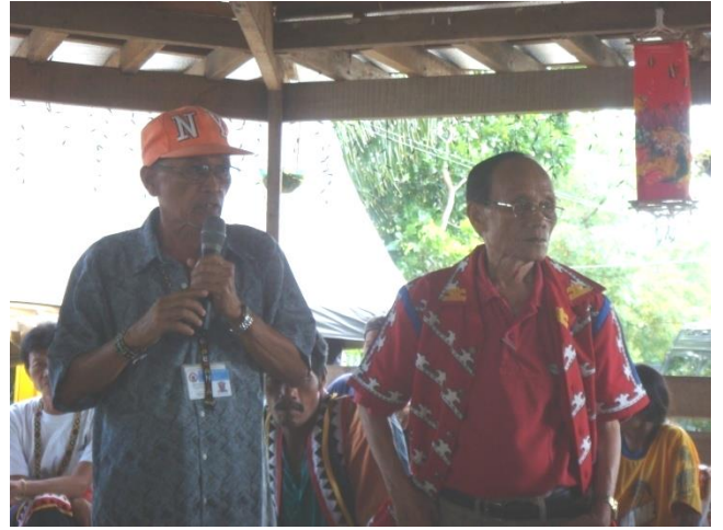
Task Force Gantangan is introduced to the Higaonon Tribal Council