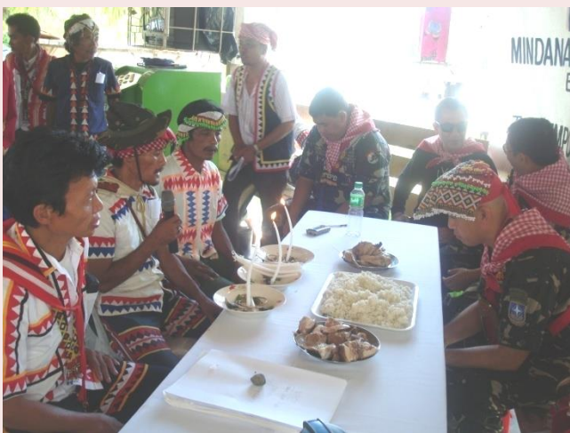
Ending the ritual with a festive meal