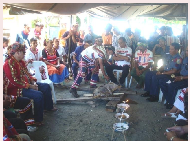
Ritual called "PAMALAS" is called before the "begola"