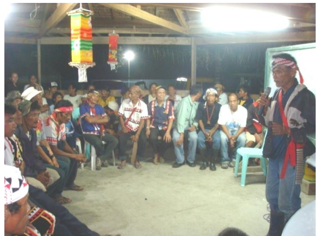
Datus who participated on the discussion