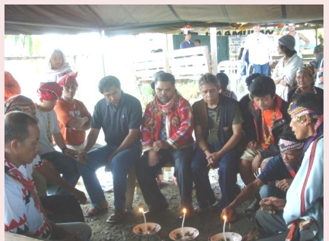
Opening ritual called "Panawagtawag" is a ritual for casting spirits

Part of the ritual is sacrificing a chicken for its blood to sanctify those who are involved