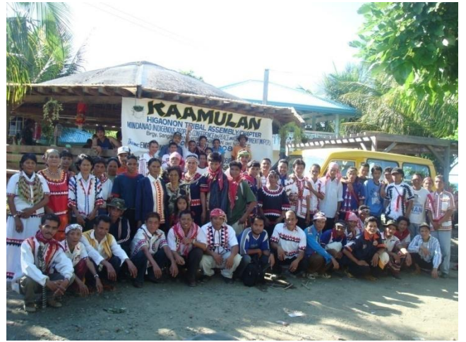
Tribal leaders and members present at the "kaamulan"