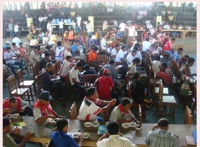
A presentation is being shown while the members are having their lunch.