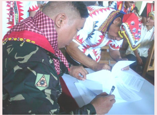
Signing of the Memorandum of Agreement between the Higaonon Tribe and the Armed Forces of the Philippines.