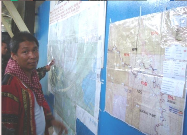
Map tracking activity