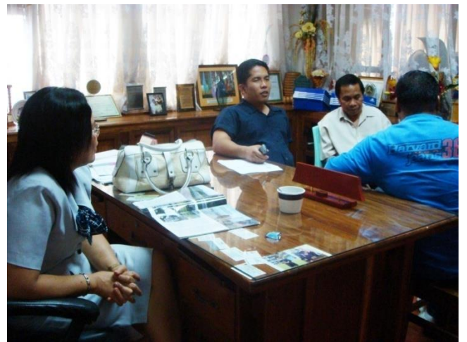
Leveling with the local government.