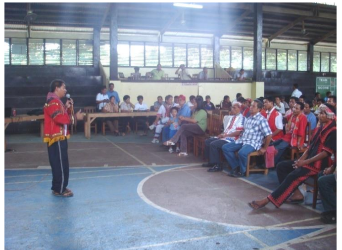
Officers of the Mindanao Indigenous Peoples Conference for Peace and Development (MIPCPD) impart encouragement to the local chapter officers and members.