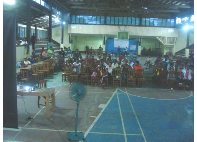
Evening came and still members of the tribe were eager to listen to what was still in stored for the day.