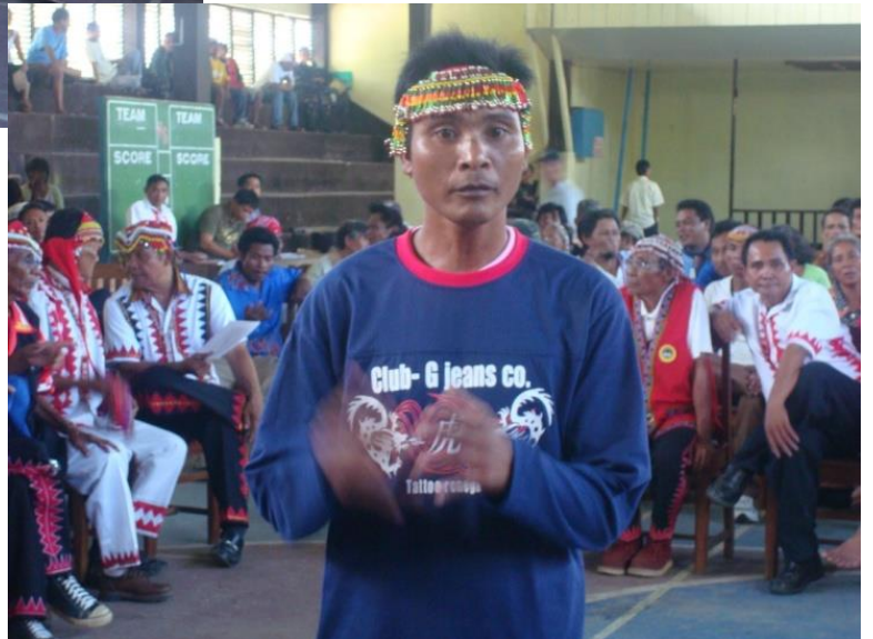
Elders and younger members of the tribe participated in the discussions.