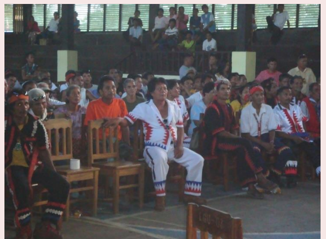
Continuously the team informed the local members of the tribe of what is to be expected for the next day's activities.