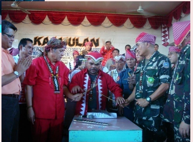
The "tampuda" is the formal act of reconciliation between the Higaonon Tribe and the Armed Forces of the Philippines.