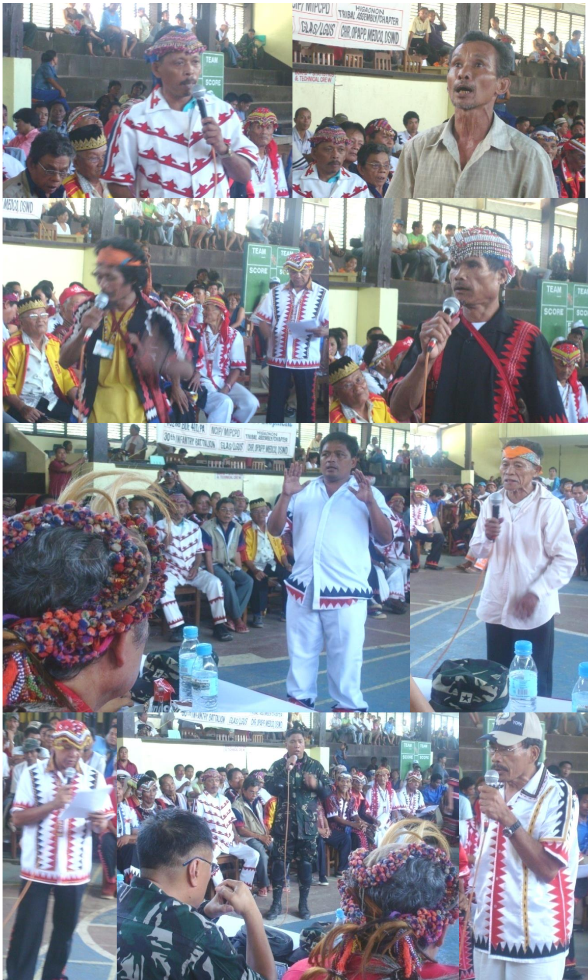
And so other members seek to be heard in this rare event where they who come from various parts of the region are gathered as one.