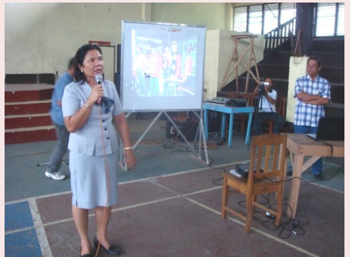
The local government unit in Esperanza share their goals and visions for the tribe.