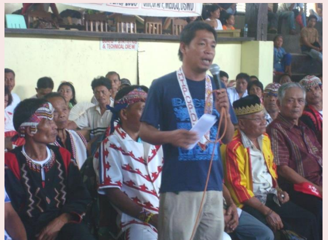
Participants share their thoughts and expectations in the activity.