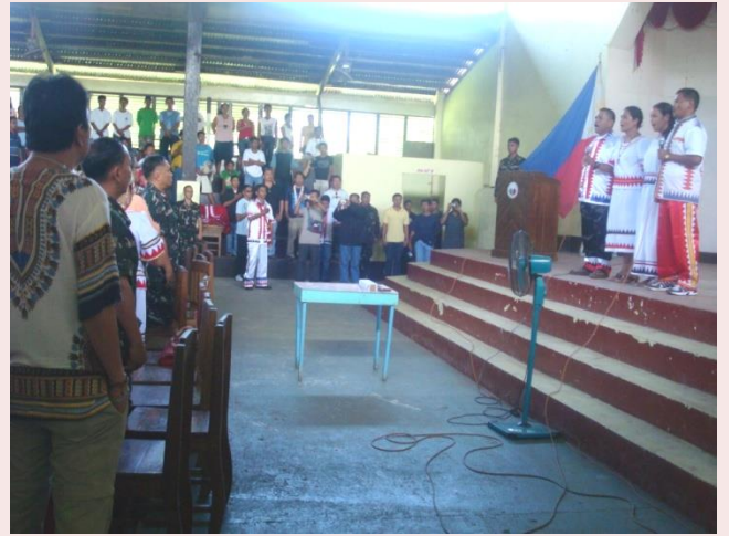
National anthem was sung with honor and pride both by the military and the IPs.