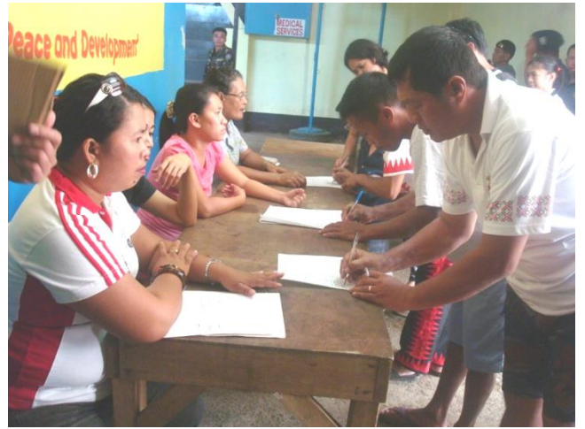
The registration of delegates were orderly initiated in the morning of April 5, 2008.