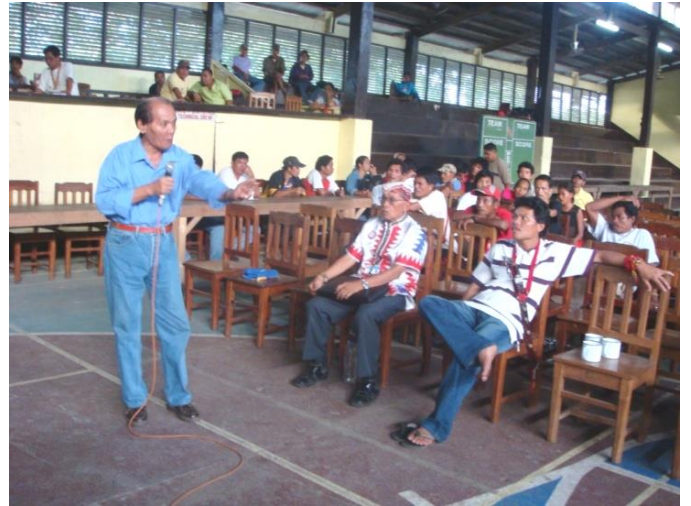
Officers of the local chapter actively interact with the government agencies' representatives in the presence of the other members.