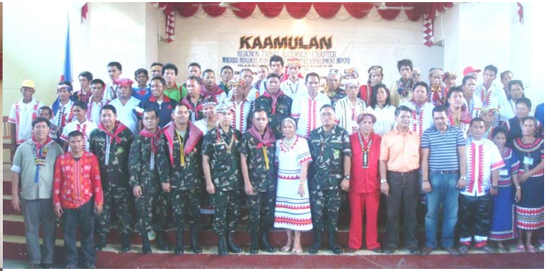
Leaders, members and guests of the Higaonon Tribal Assembly all pose together for a photograph of the moment they all united as one in the quest for peace and development.