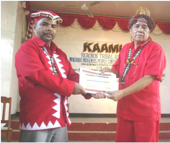
Certificates of appreciation were presented to the camera.