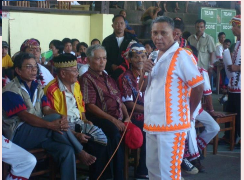
Tribal leaders speak up for their respective territories.