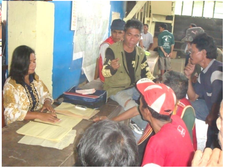
The Council of Elders and some other tribal leaders discuss the contents of the Peace Agreement that their officers and the AFP officers will sign during the "tampuda."