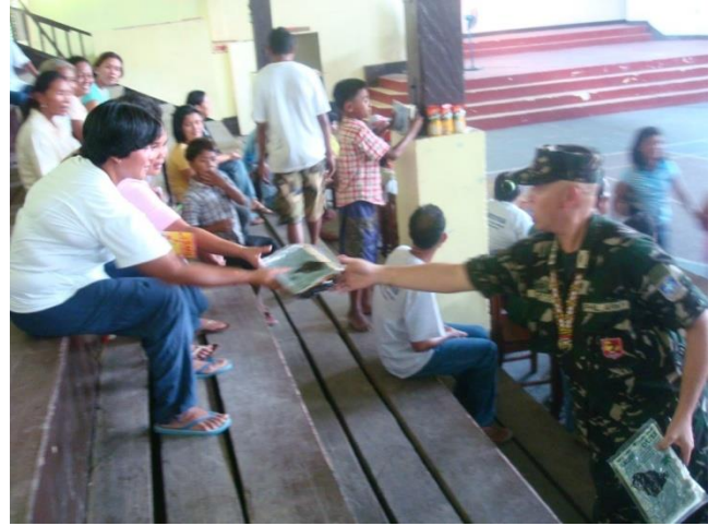
Delicacy packs were being distributed to the local members of the tribe who were present at the Paglaum Gym in Esperanza, Agusan del Sur.