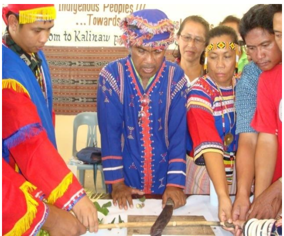
Peace pact or "MIG KASOBAD"