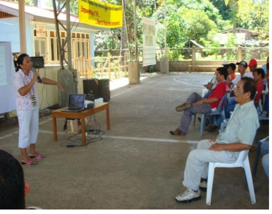
The 3 phases of the IP-SOT are explained