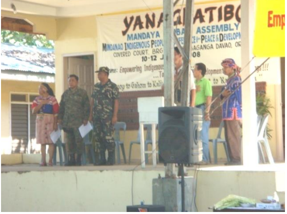
Singing of the national anthem