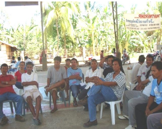
Grouped in syndicates for easy management on the topic