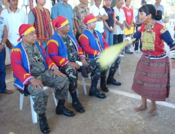
Event of investiture where these officers are being adopted by the tribe