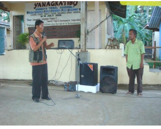
Questions about MIPCPD are answered by its Development Officer