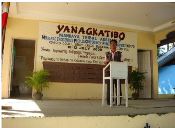
Talk about the traditional political structure of the lumads