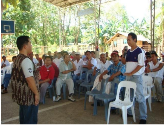
Inquiries about the topic are thrown by some of the participants