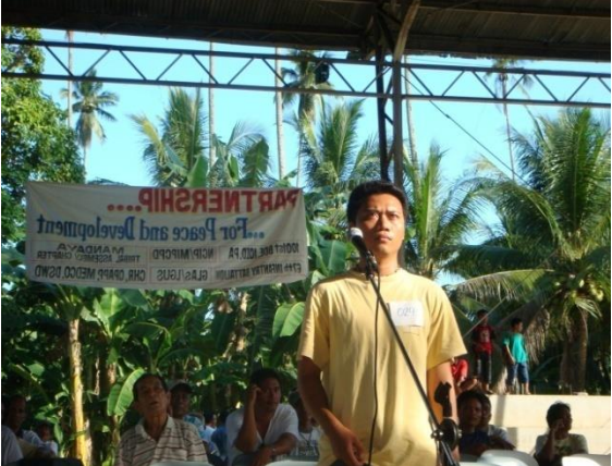
Interaction between the audience and the speaker