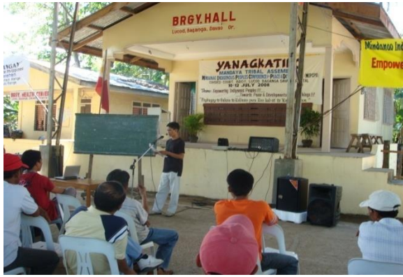
A talk about the lumad community