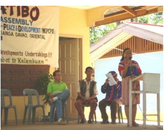
Formal welcoming of the participants for the "Yanagkatibo"