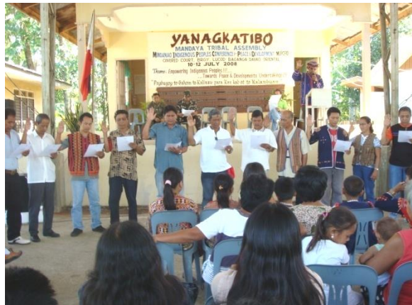
Oath taking ceremony for the local elected officers of MIPCPD