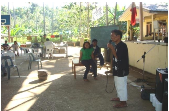
An intermission song number both from the two tribal members