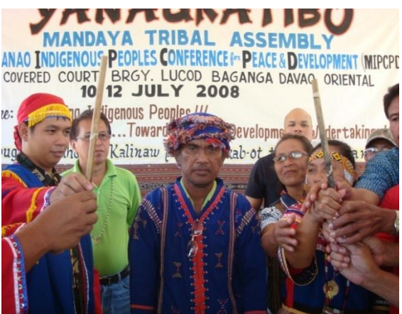
Conclusion of the peace agreement