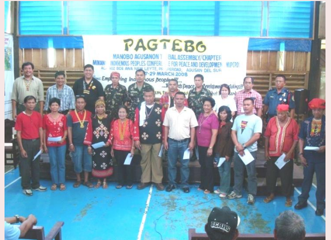
MIPCPD Prosperidad Local Chapter officers pose with the guests of honor for this event.