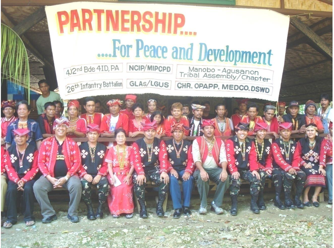
Photo opportunity of the newly-invested datus and bae with the witnesses from the local tribe.