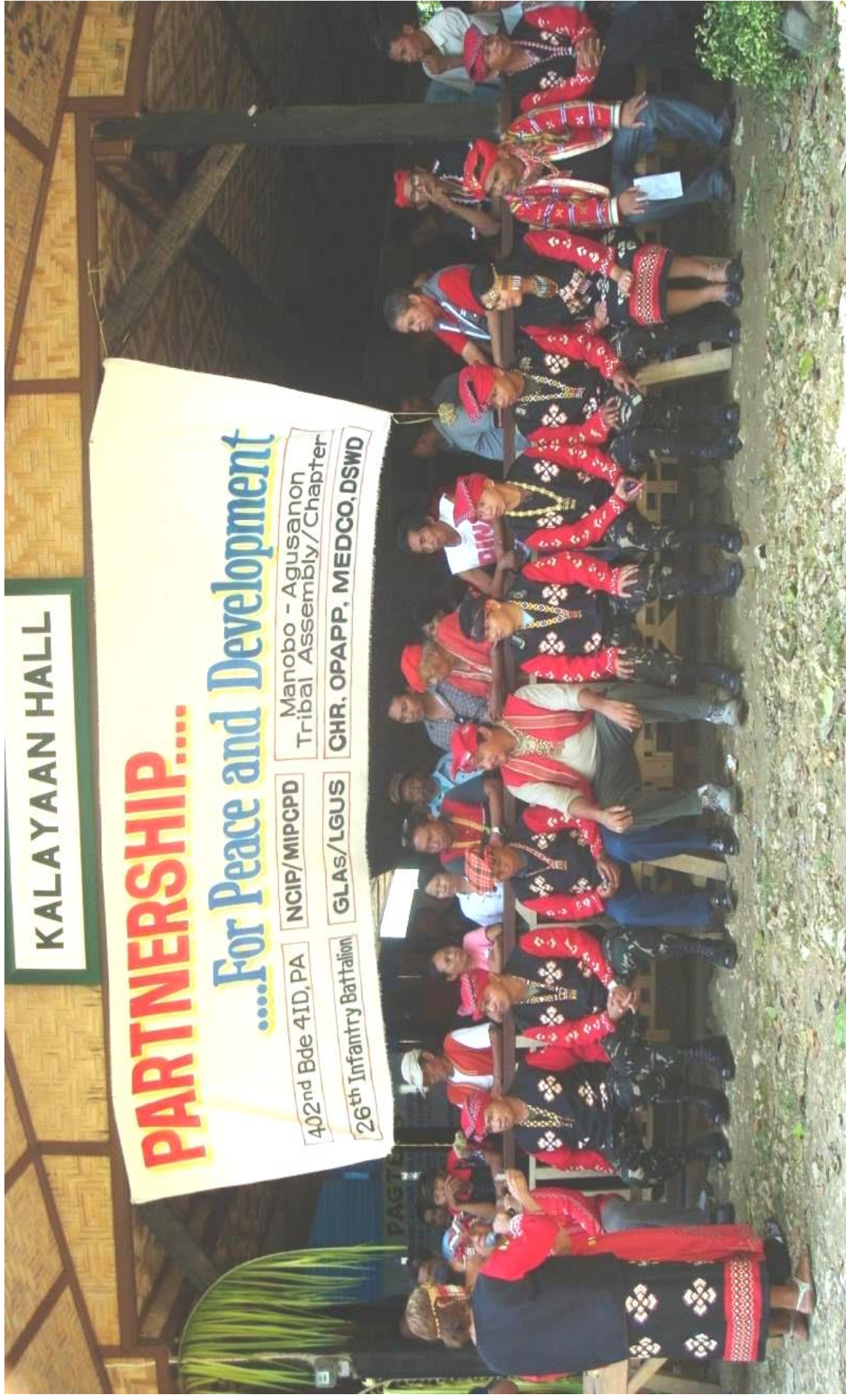
The newly-invested Datus and Bae listen as obligations and duties of each is explained