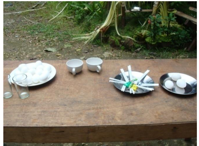
Elements usually found in a ritual for adoption