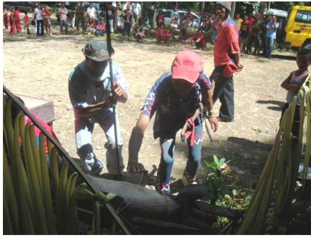
This ritual is then for the investiture or adoption of datos and bae