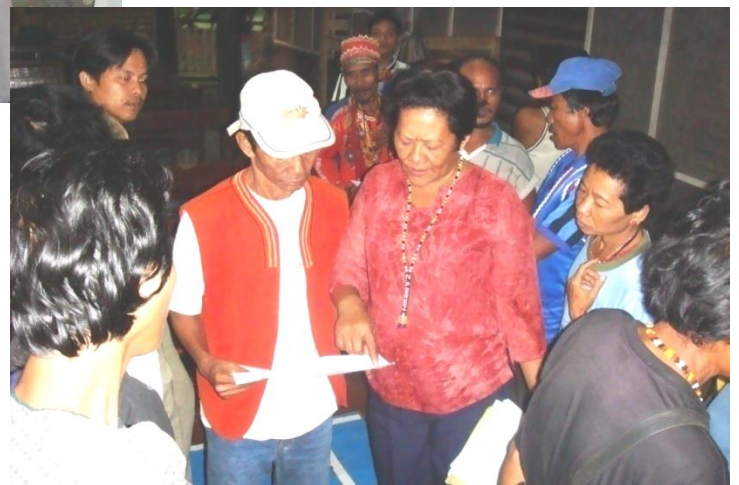
Local Lumads of Prosperidad, Agusan del Norte start to register for the event.