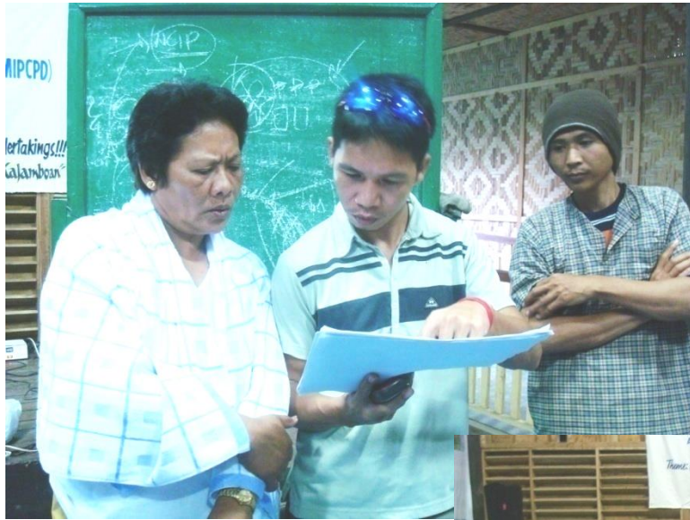
Map tracking exercise is being explained promptly to one of the delegates.