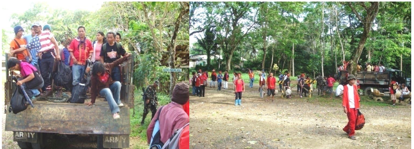
Arrival of participants at the venue.