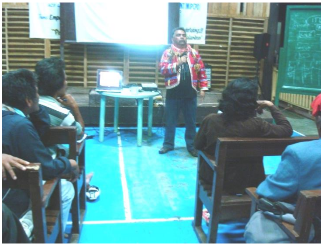
The Chairman (left) and Executive Director (right) of MIPCPD lecturing about the culture and the tribes' situation.