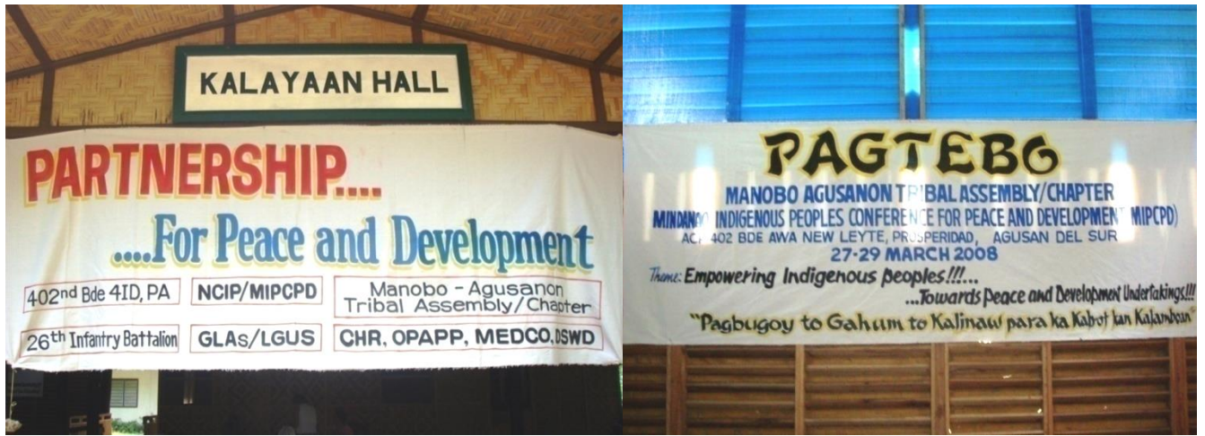
Streamer at the Kalayaan Hall where the "Pagtebo" will take place.