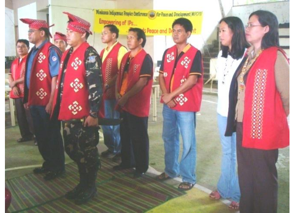
The Manobos' of Lingig (above) and the LGU/GLA (below)