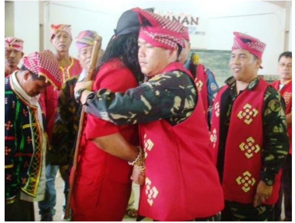
Peace pact of the Manobo tribe and the AFP together with the witnesses from the different sectors of the government