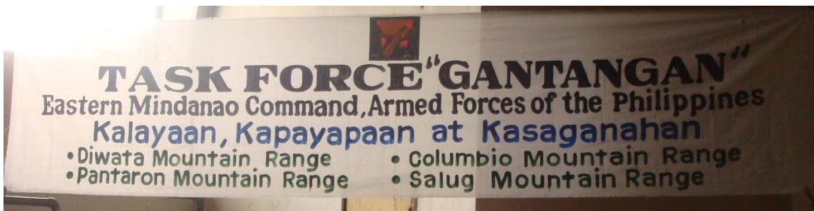
Streamers posted at the gym at Poblacion, Lingig Surigao del Sur