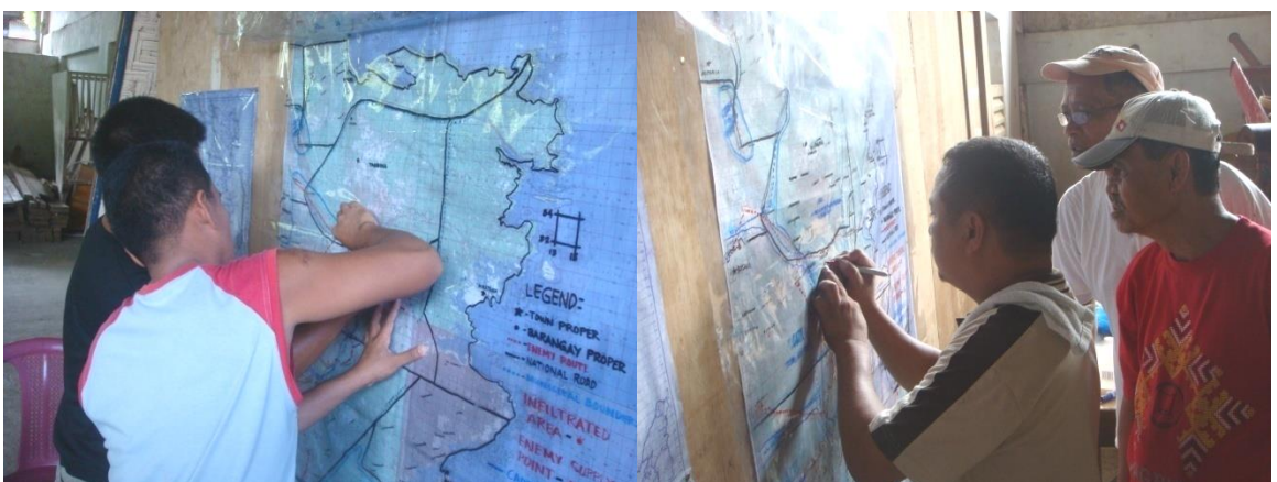
Plotting on the map where the enemy route is proved to be a very easy task for the locals of Lingig