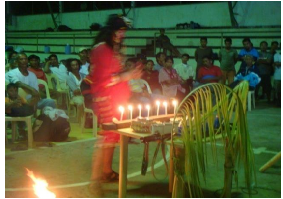
Ritual called "Panagwagtawag" to call on spirits' blessings upon the entire event