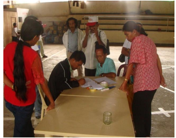
Participants are slowly arriving one by one heading straight to the registration table