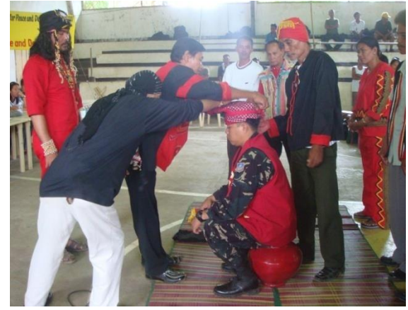
Ritual of adoption