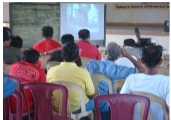
Film showing about a poor peasant who became a CPP-NPjA rebel but was later killed by his NPA comrades in "Huwad na Pangarap"