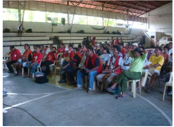
One of the officers from the local assembly of the MIPCPD giving his speech