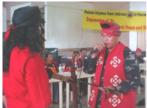
Sinugbahan" or Peace Pact between the Manobos and the AFP