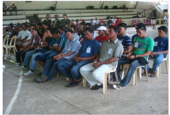
Introduction to the program