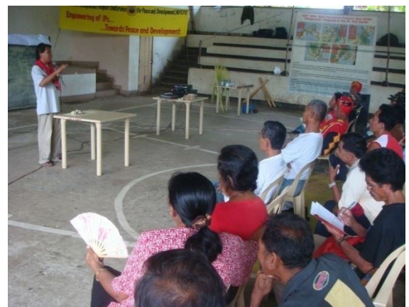
Introduction on the subject "Knowing the Enemy"