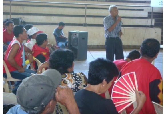
More members of the MIPCPD local office speak out for the tribe