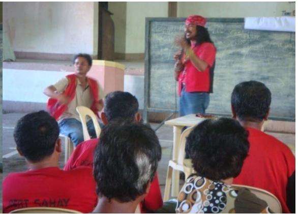
Local officers of the MIPCPD shares some stories about the tribe