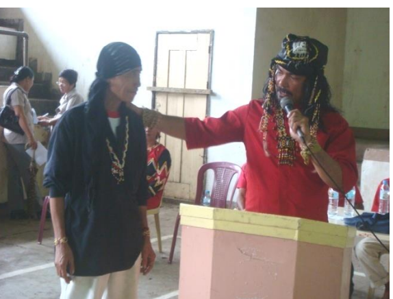
Introduction of the next part of the program which is the investiture of AFP officers and representatives from the LGU/GLA