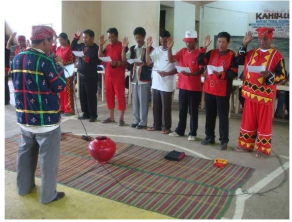
Oath taking of the elected local officers of the MIPCPD