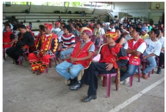
The leader of the tribe gives his introductory remarks