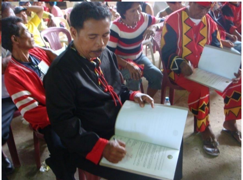
Peace pact signing