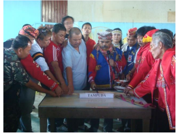
"Tampuda" or Peace Pact