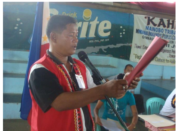
Declaration against the NPA and peace pact agreement is read to the members of the Council