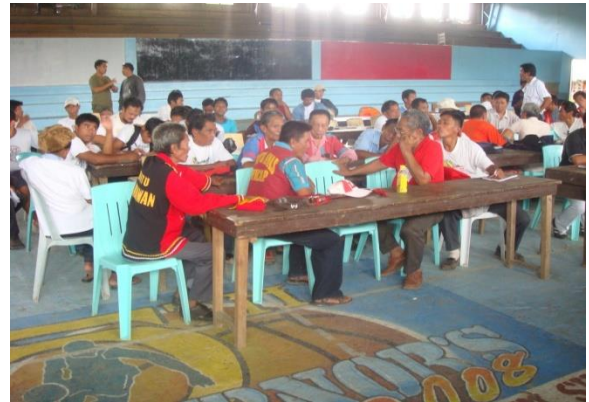
Divided into sub groups to dissect the topic