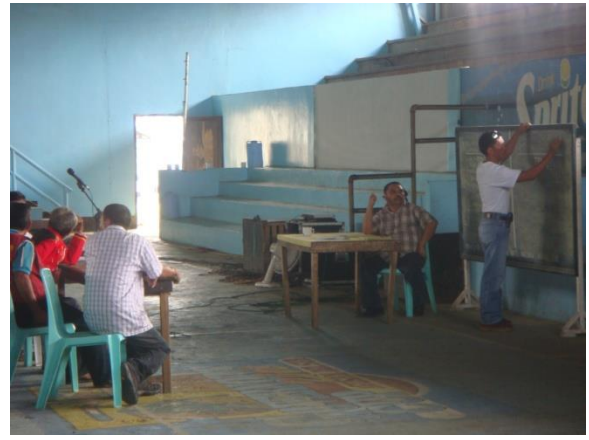
Discussion about the security and economic situation of the tribe