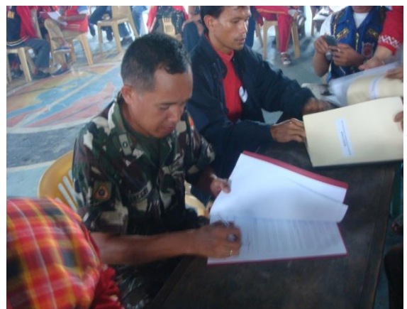
Signing of the peace agreement between the AFP and the tribe