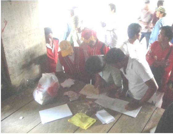
Registration was done the tribal way