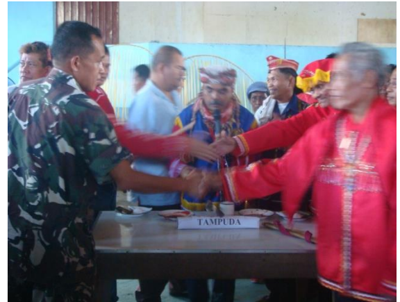
Exchange of the sticks and hand shake that seals the pact