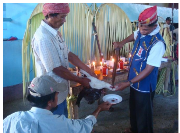
The sacrificial chicken