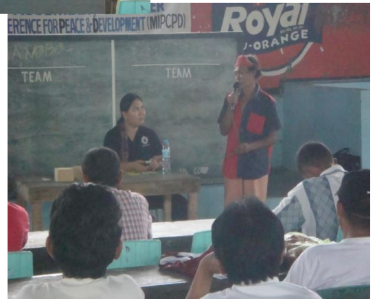
Members introduced themselves