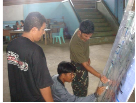
Tribal boundaries and CPP-NPA movements is being plotted on the map for information of the AFP troops