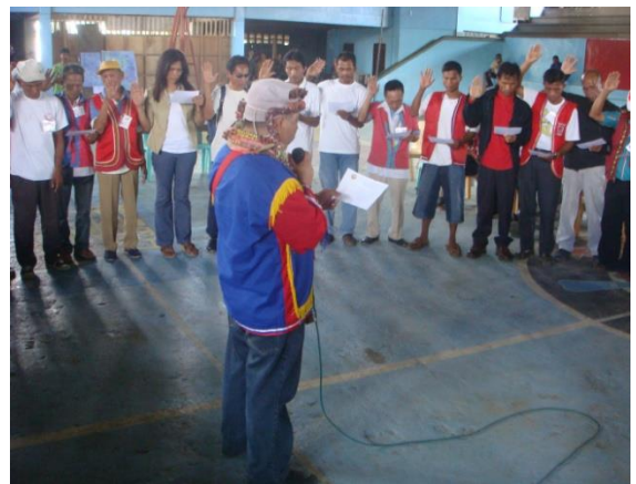
Oath-taking ceremony of the local elect officers of the MIPCD