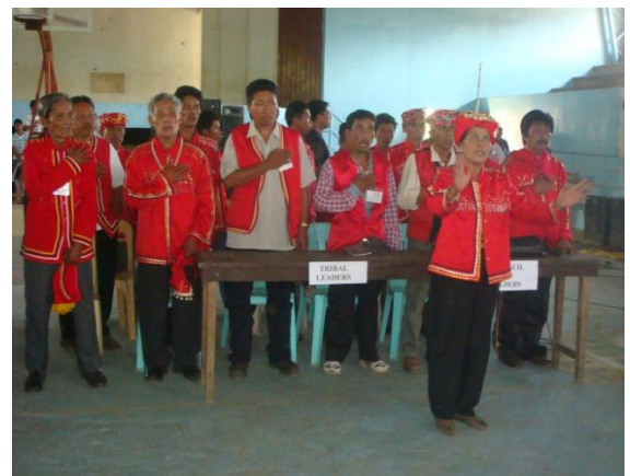
Singing of the national anthem