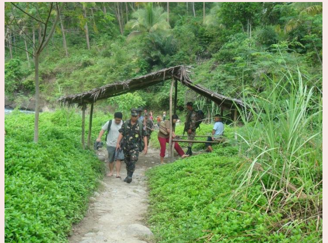
The team heading towards PANGAYLAN.