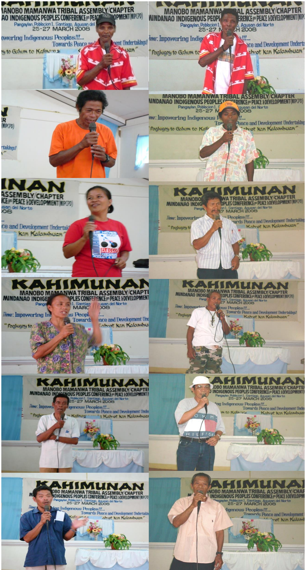
Indigenous peoples from the Manobo and Mamanwa tribes who participated in the early part of the discussions.