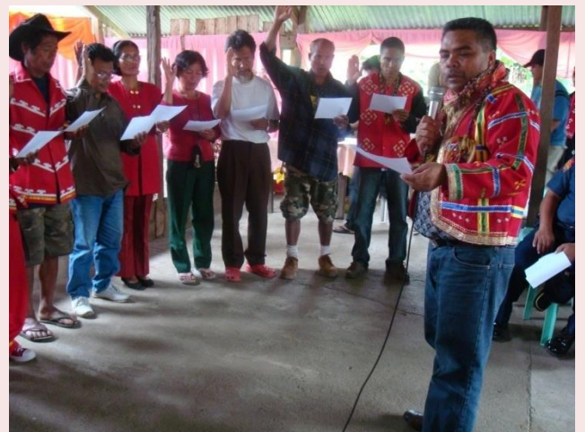
Local elected leaders of the Manobo-Mamanwa Tribal Assembly in Santiago, Agusan del Norte take oath headed by the Chairman of MIPCPD.