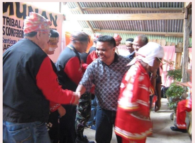
The newly adopted datos and bae are being welcomed by the indigenous people of Santiago and by the Chairman of MIPCPD.