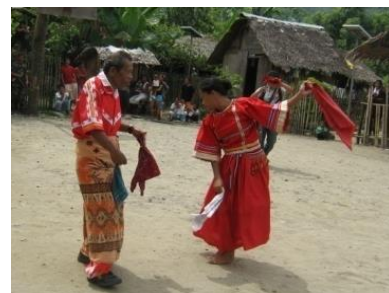
Manobo and Mamanwa dancers prove that their traditional dance is still alive.