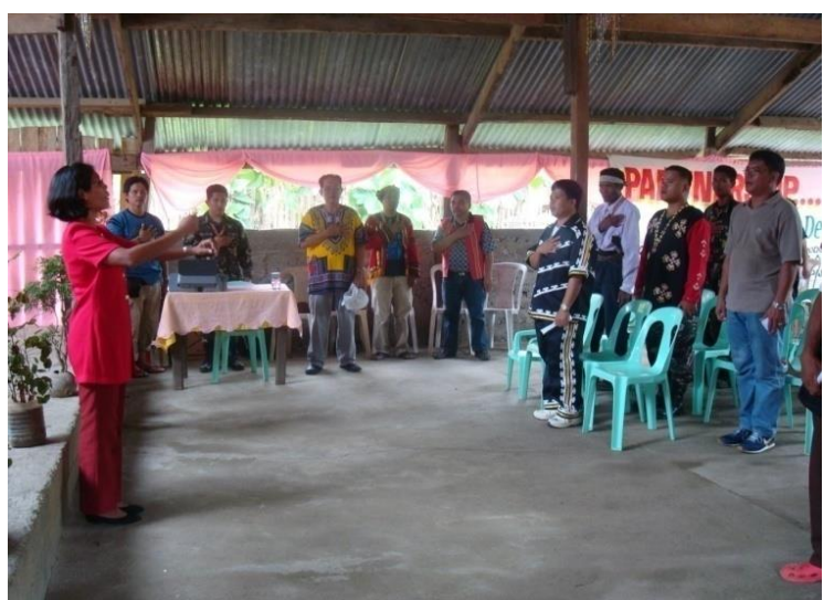
The national anthem was led by a lady from the tribe.