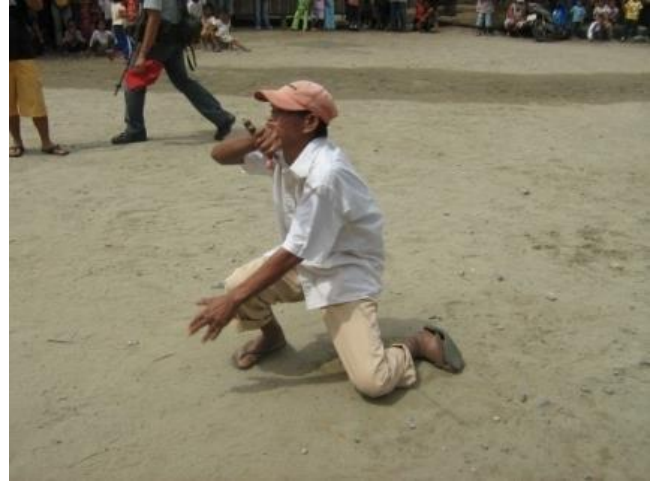
A bit of a tribal war dance was shown by this man.