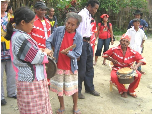
Musicians of the tribe gives authentic indigenous beat to the tribal dance that marks the start of the ritual for the peace pact or " tampuda. "