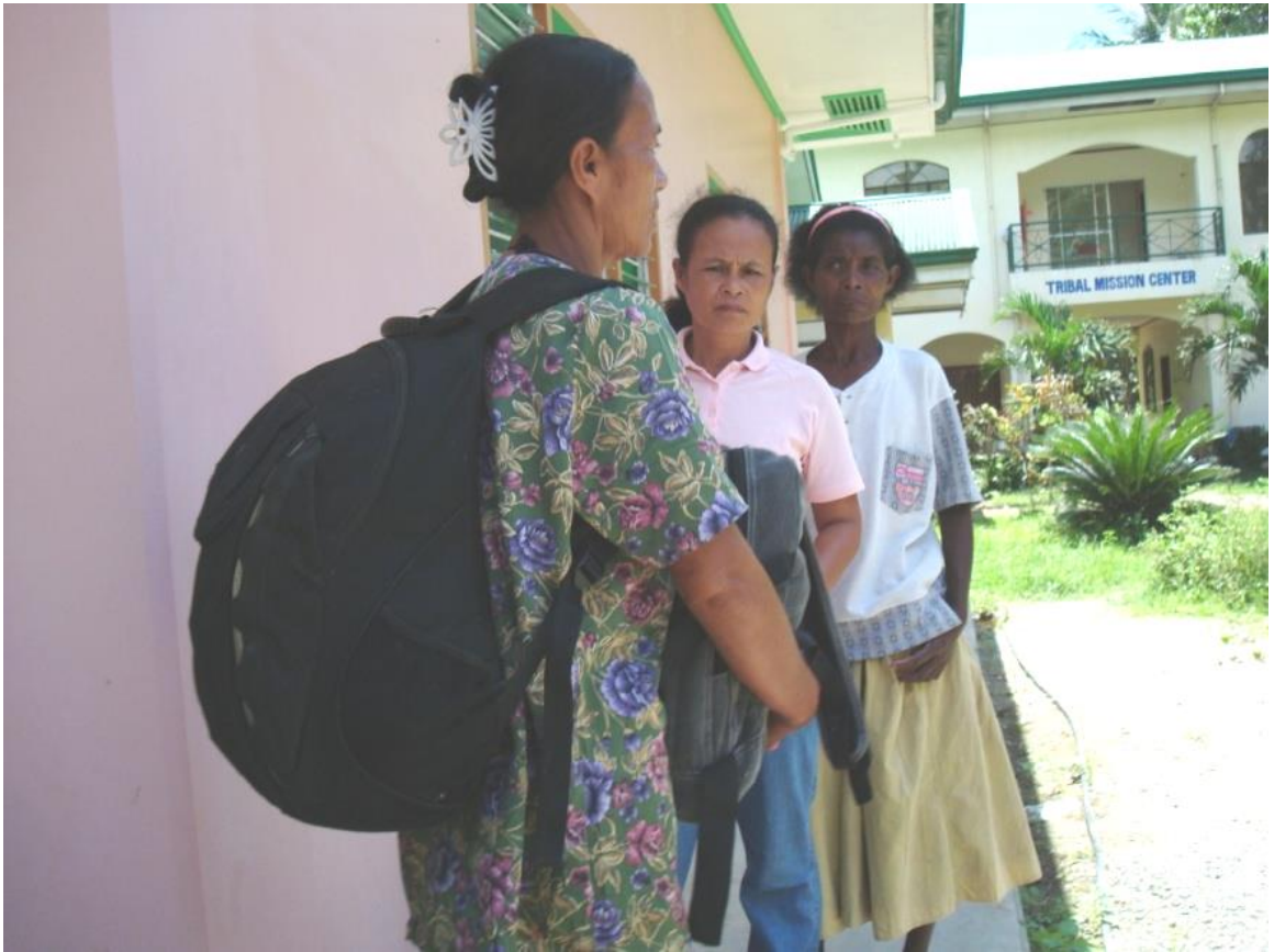
Tribal delegates arrive one by one and register for the event.