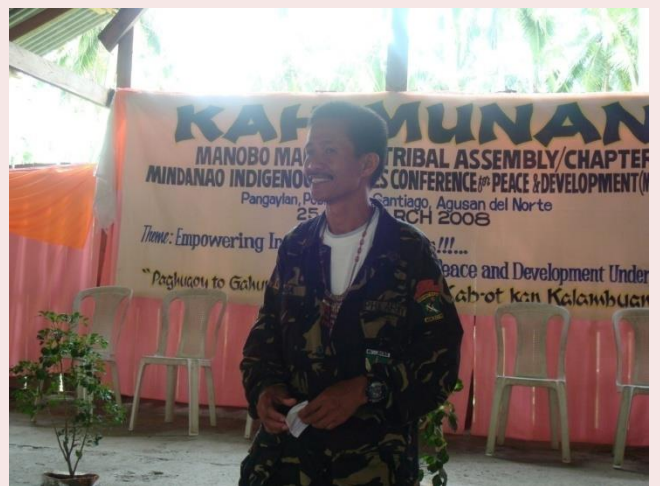
Other speakers share their views with the tribes.