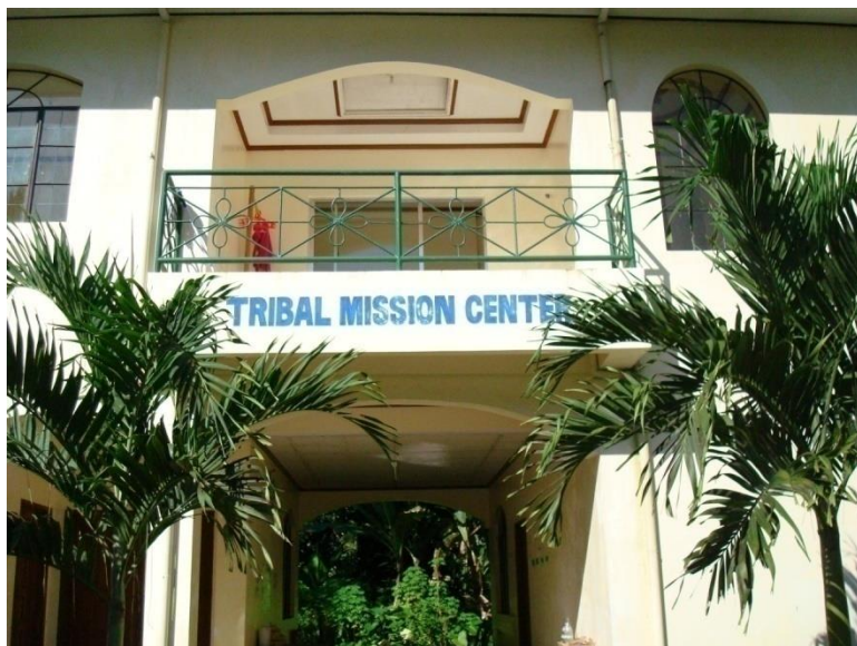
Venue of the "Kahimunan" or Tribal Assembly.