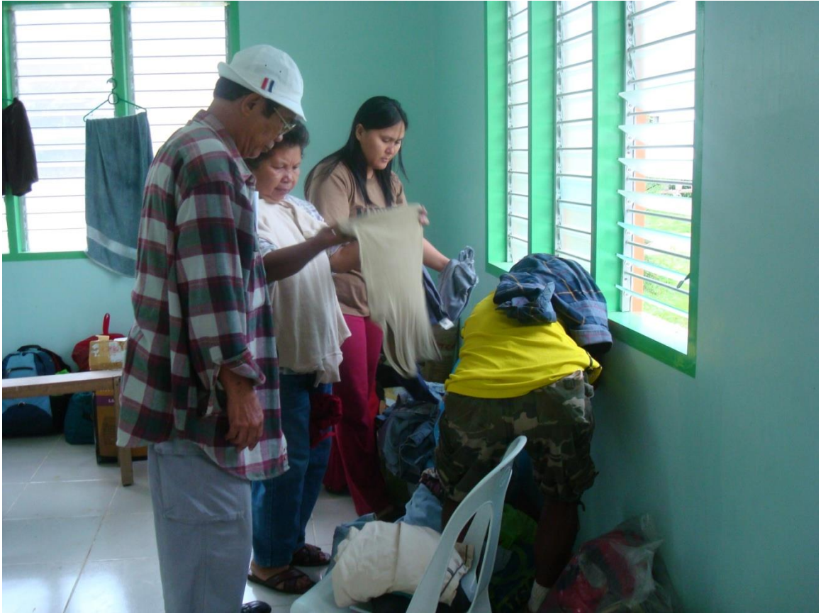
Part of the IPMPDU in Santiago, Agusan del Norte was the distribution of used clothes among the residents in the IP community in Pangaylan.