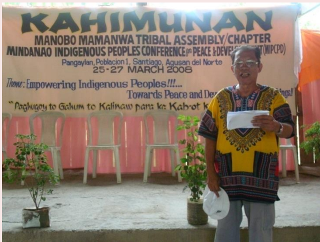
Testimonies on the violations against the tribes were given by some of the members.