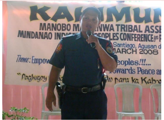
Guest speakers from the government agencies speak on behalf of their respective offices.