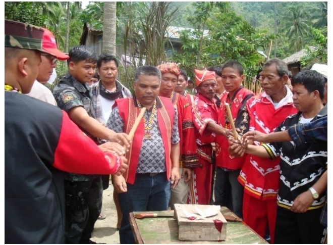
“TAMPUDA” – peace pact; the highlight of the activity where all forms of conflict between the Manobo and Mamanwa tribes and the AFP are ended and an allegiance for peace and development is formed.