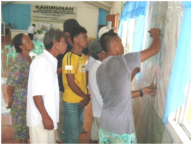
The map tracking exercise kept the participants preoccupied for a while.