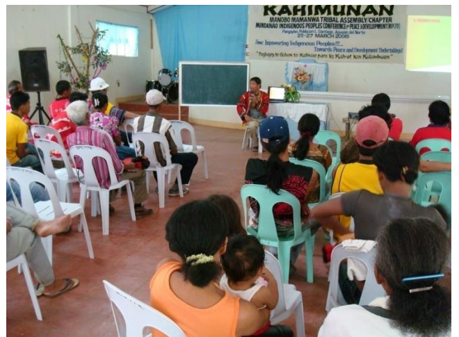
Discussion about "Knowing the Enemy."