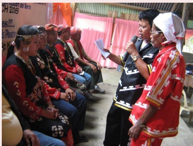
The "baylans" facilitated the investiture rites or adoption ritual for individuals that give their commitment to help the tribes.