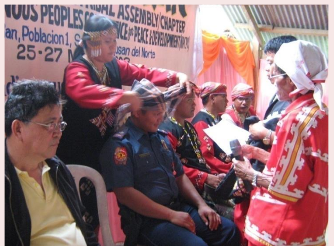
"Tangkulo" or the headdress for men is a sign of leadership and authority. Usually, its design is indicative of the tribal leader's position and/or characteristics as a leader.

Among those who were adopted into the Manobo and Mamanwa tribes were representatives from the local AFP and PNP units; also with some of the TF "Gantangan" team.