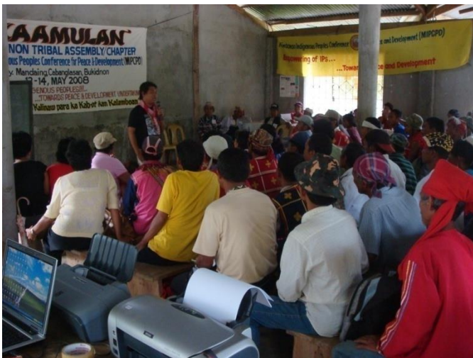
Initial briefing for the participants of the IP SOT