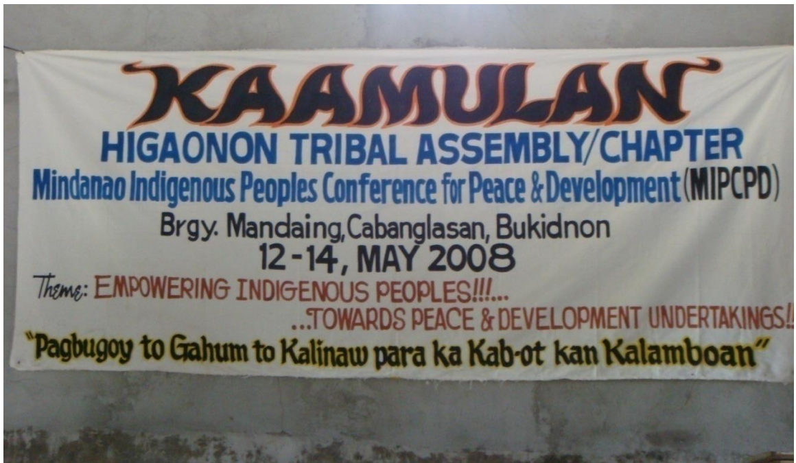
Streamers for the Higaonon Tribal Assembly's "KAAMULAN" in Cabanglasan, Bukidnon on 12 – 14 May 2008