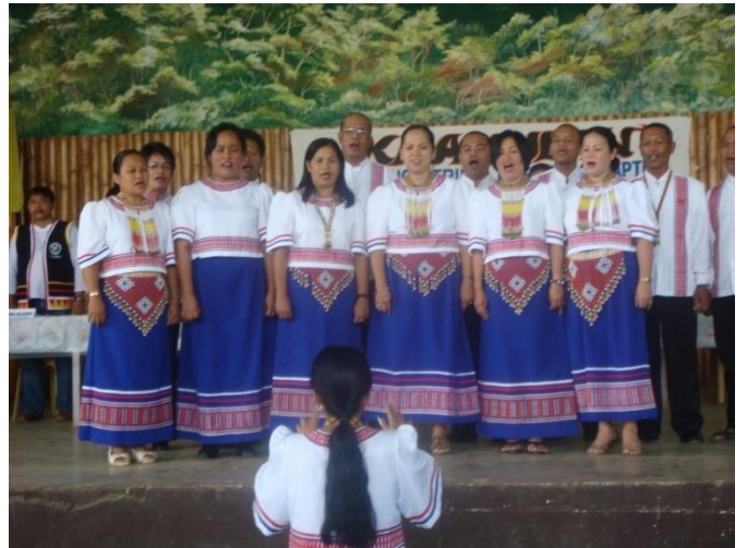
A presentation from the members of the tribe