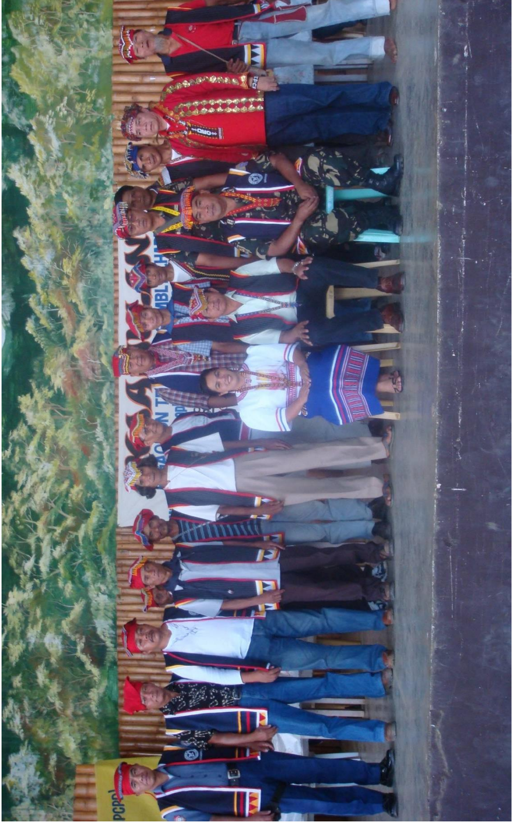
Newly-recognized members of the Higaonon tribe pose with the leaders and officers of the Higaonon and Umajamnon tribes