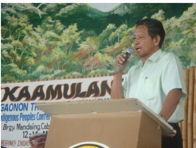
A well-delivered speech by one of the LGU representatives present