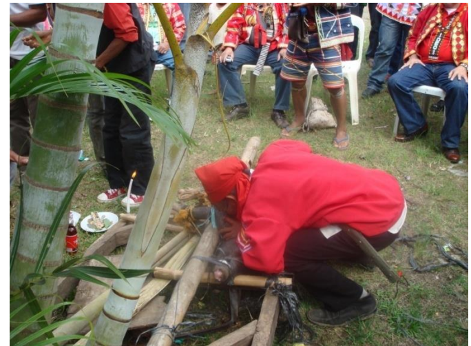
Sacrificing the pig and drinking its blood is part of the ritual