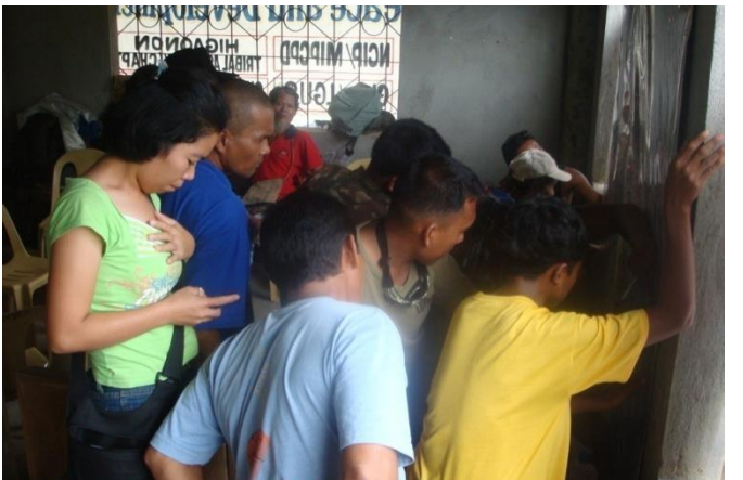
Tribal boundaries and enemy routes are being marked for reference of the AFP operatives