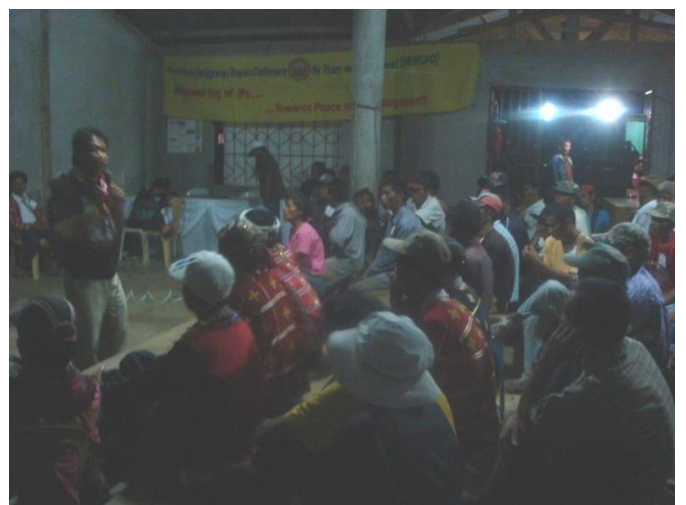
Talks of the tribal leaders ran well into the night for the