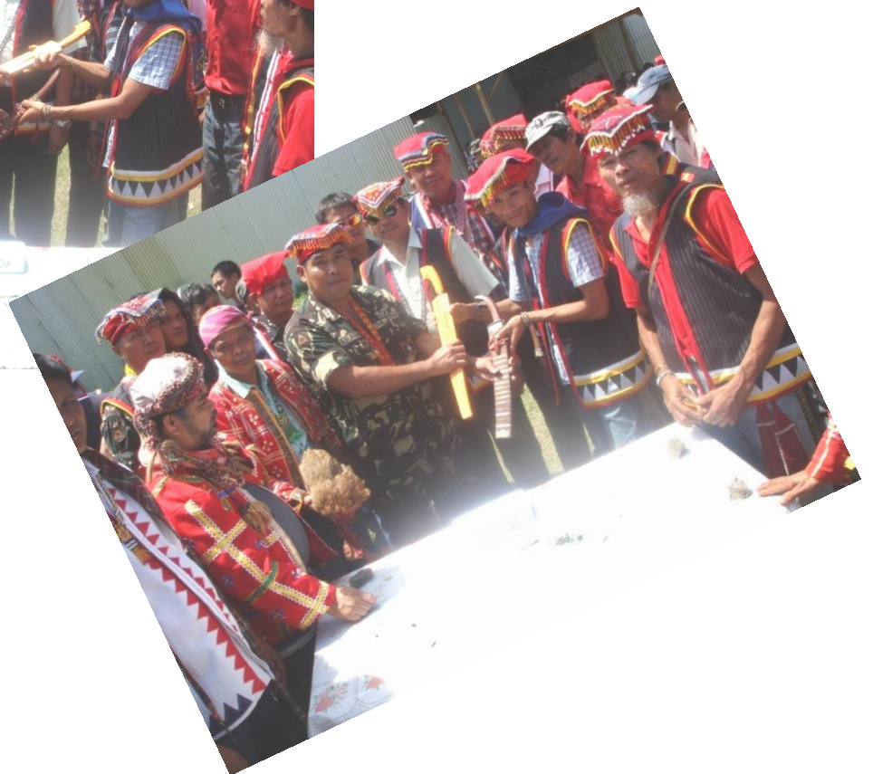
Exchange of " sablis "