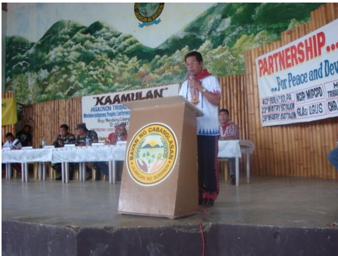
A message is delivered by a tribal leader from the Higaonon tribe