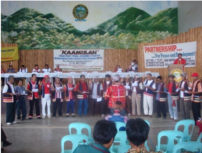
MIPCPD local chapter elected officers for the Higaonon Tribal Assembly, Cabanglasan Chapter