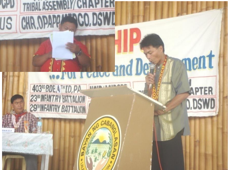
Tribal leaders bravely gave testimonies of their experiences in the hands of the CPP-NPA