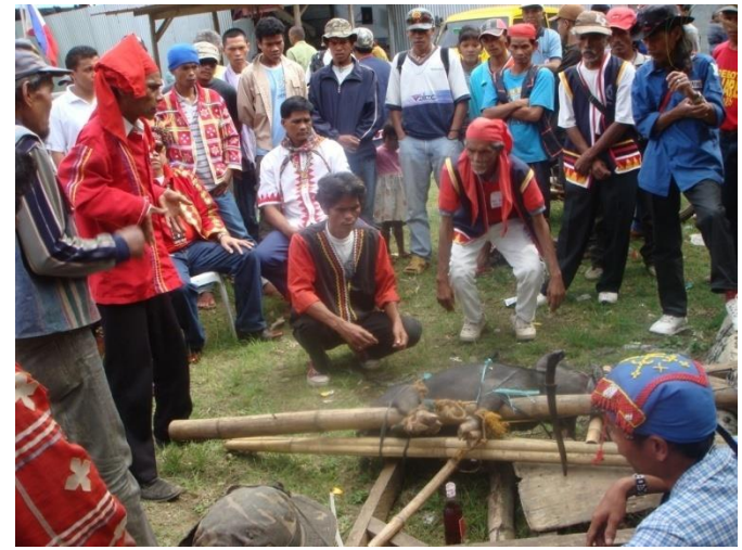
Start of the ritual process