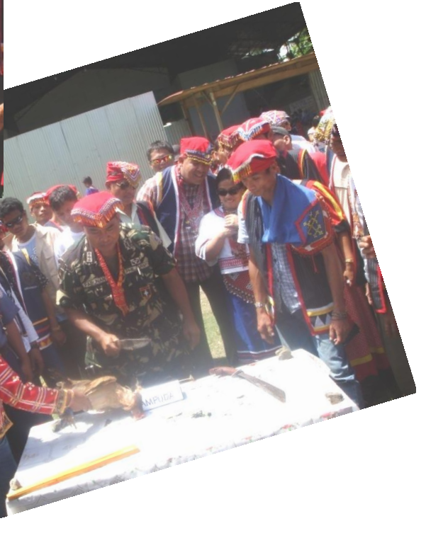
Peace pact offerings