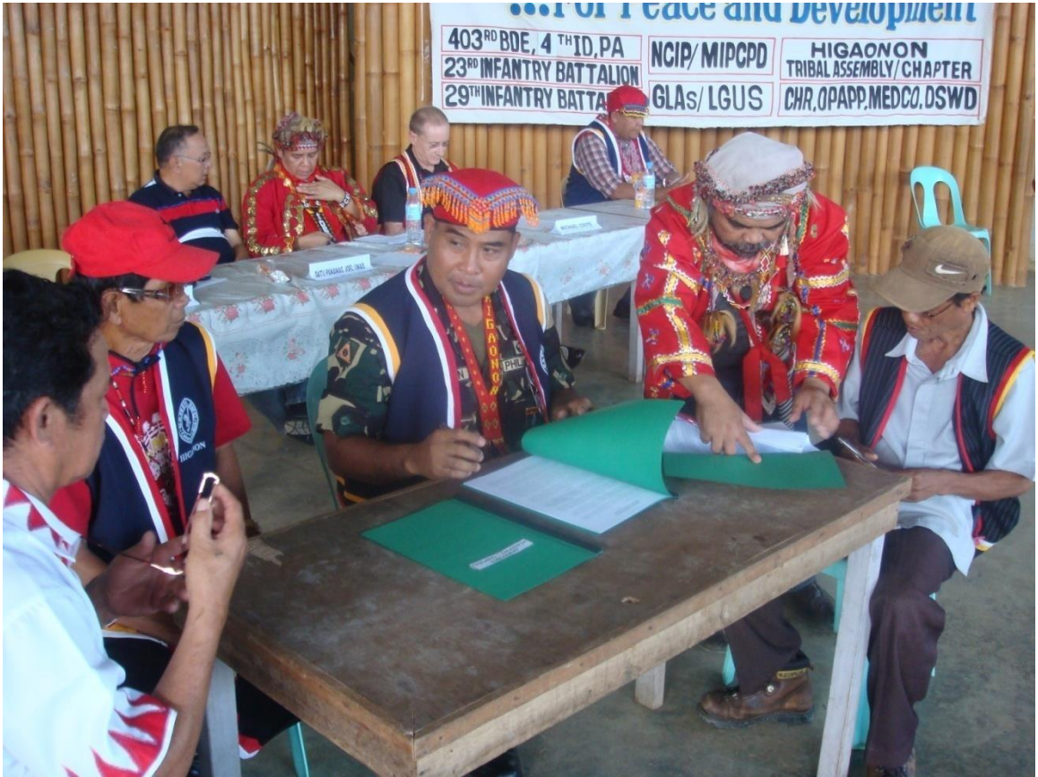
Signing of the covenant of peace between the tribe and the AFP