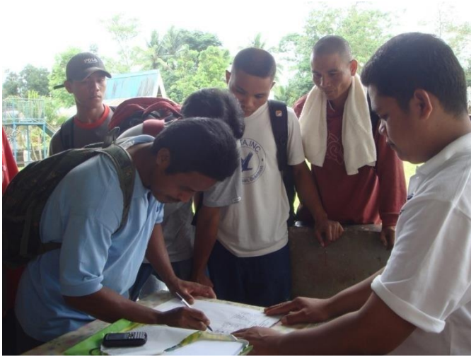
Members of the Higaonon-Umajamnon tribes register for the IP-SOT