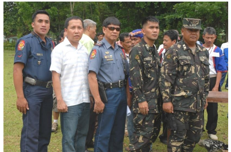
Guests from the local government (LGU), government line agencies (GLA), military and police.