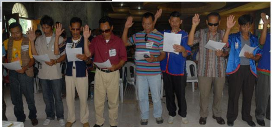
Oath taking ceremony for the elected local chapter officers of the MIPCPD