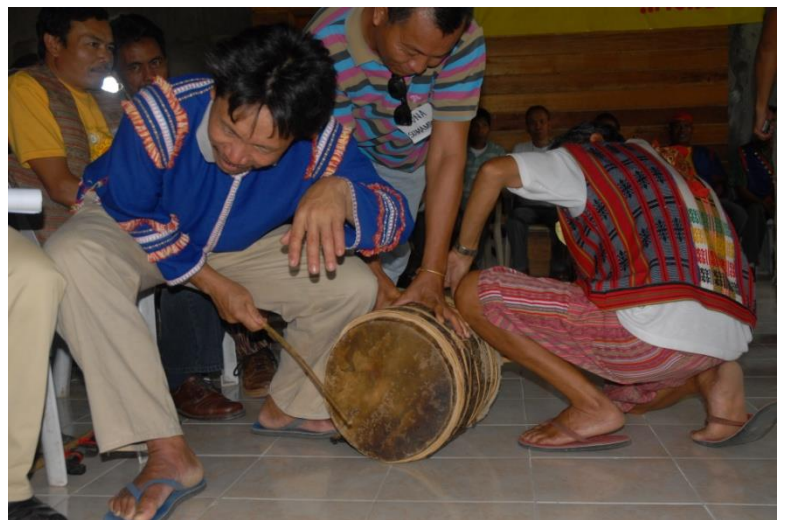
Musical ingenuity displayed by the members of the tribe