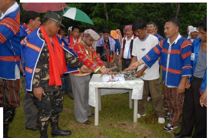
Sacrificing of the rooster and shedding its blood ends the ritual and marks the beginning of unity between the tribe and the AFP with the cooperation of other government representatives.