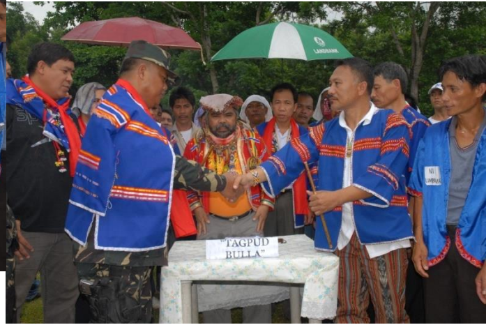
"Tagpud Bulla" (peace pact) between the Mandaya-Mansaka tribes and the AFP.