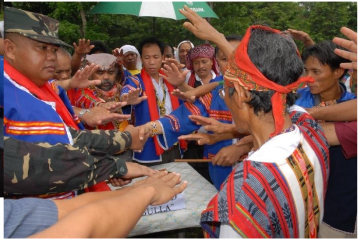
Everyone present extend their hand over the ritual elements to signify that they are now united as one for peace and development.