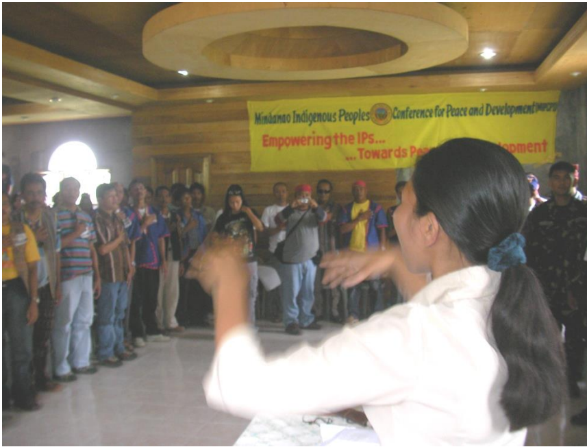
Singing of the national anthem