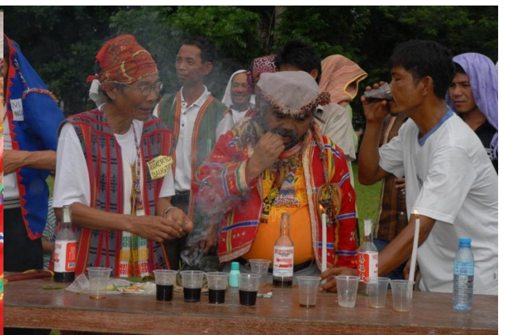
"Communion" with the tribe prior to the "tagpu bulla" (peace pact)