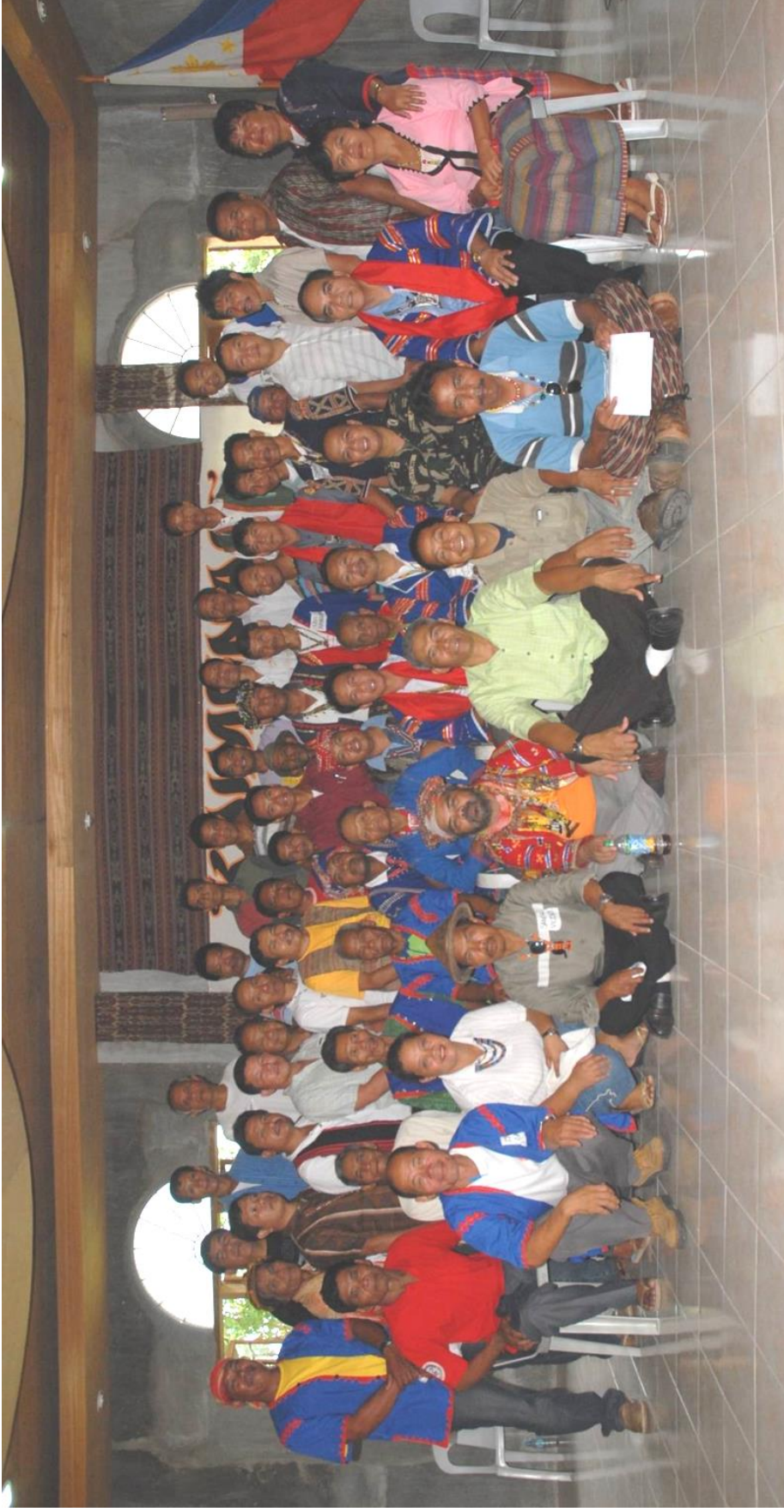
Tribal leaders from different tribes pose together to preserve the memory of this historical event.