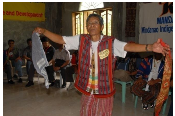
A tribal dance exhibition from the different tribes present during the final program.