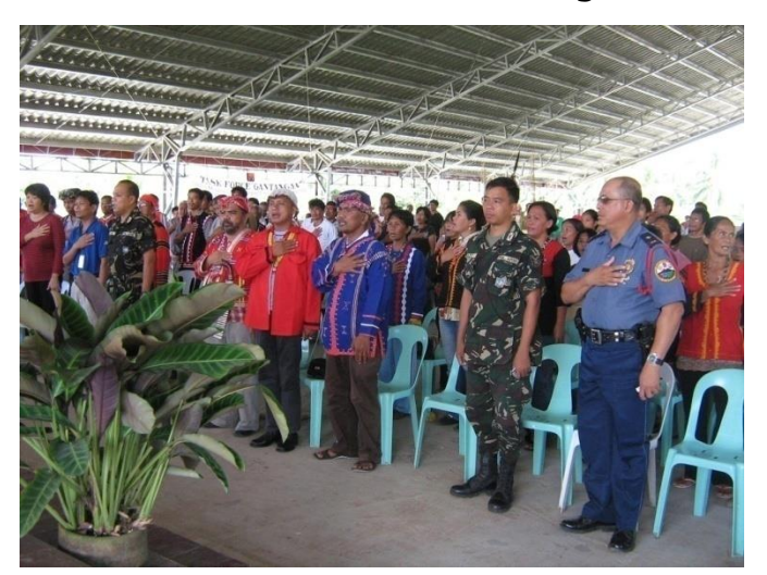
Singing of the national anthem