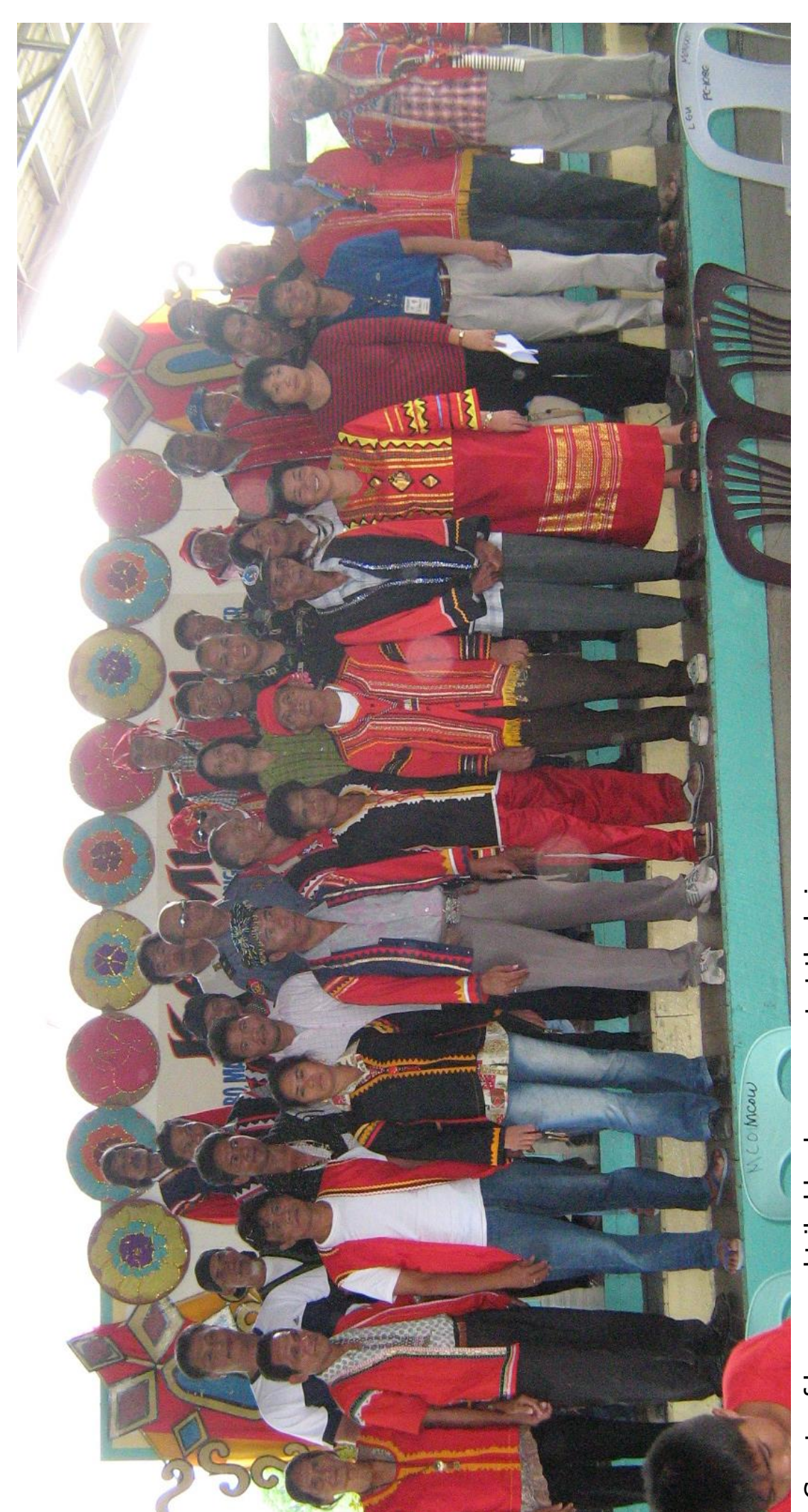
Guests of honor and tribal leaders present at the kaimunan