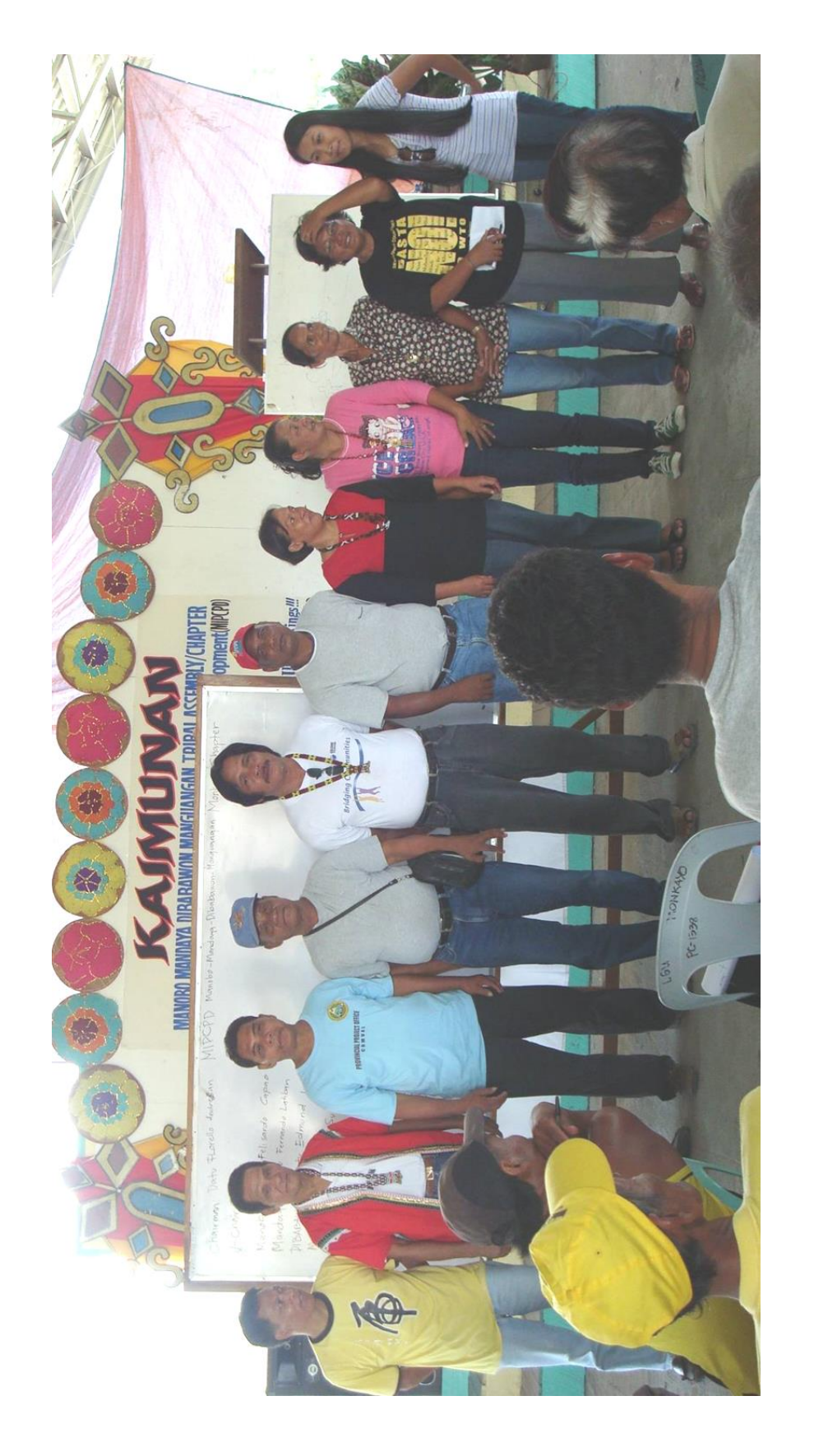
Elected local chapter officers of MIPCPD