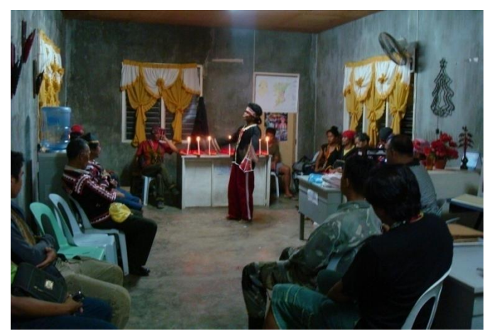
Ritual for the "baganis" or the tribal defense warriors