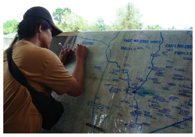
As part of the program for the AFP to be informed of the territories of the IP delegates and routes of the CPP-NPA, this map is being marked by the soldiers and Lumads alike