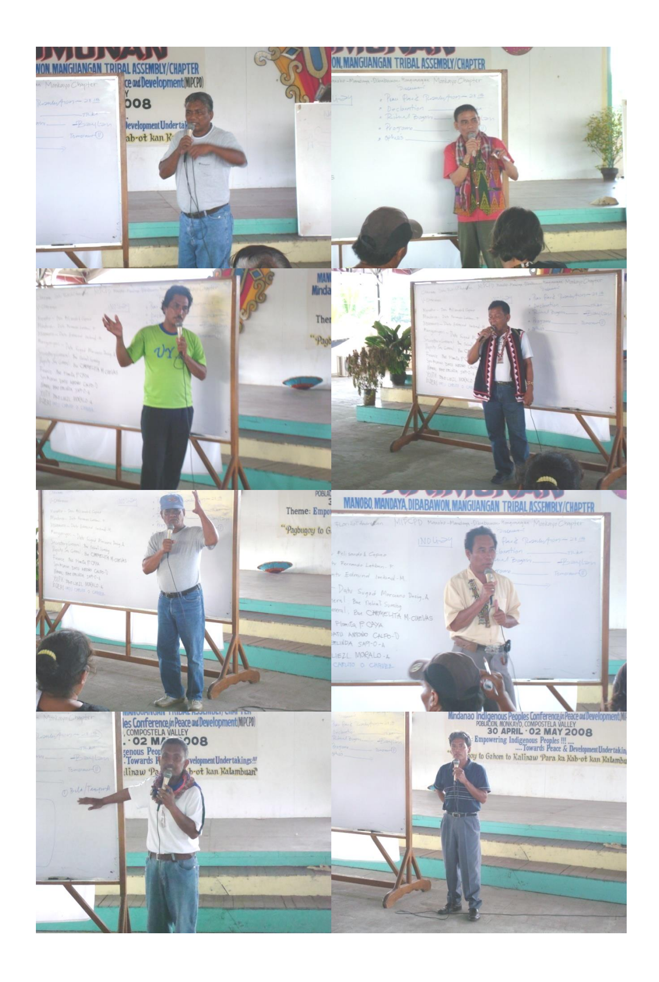
Tribal leaders are giving their comments about the topic in human rights violation