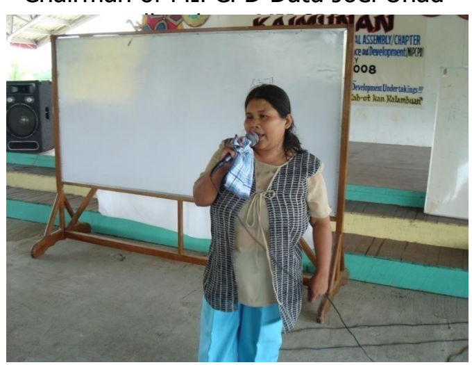
Sharing experiences they had in their tribe