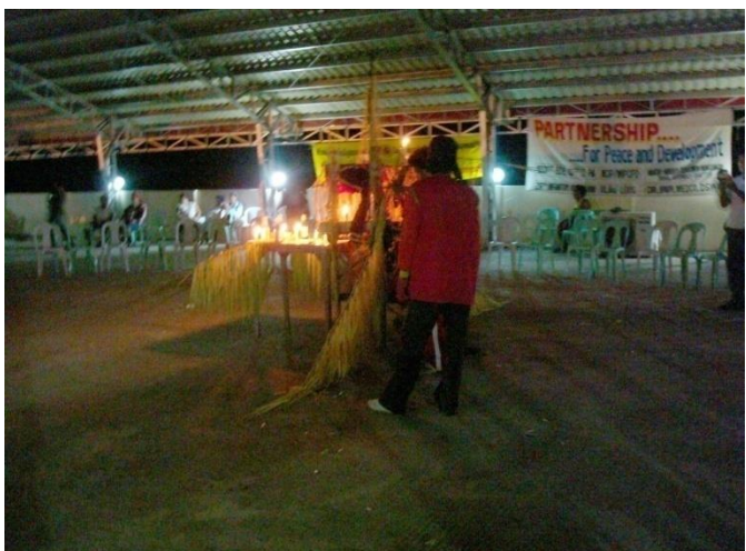
Closing ritual for the bagani forces