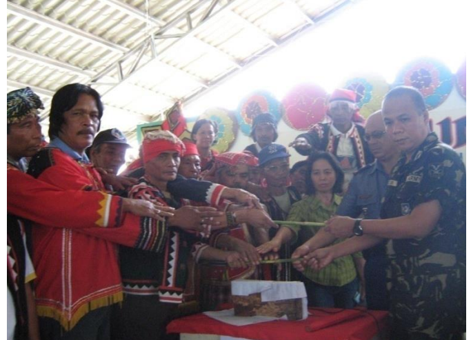
Closing ceremonies of the peace pact