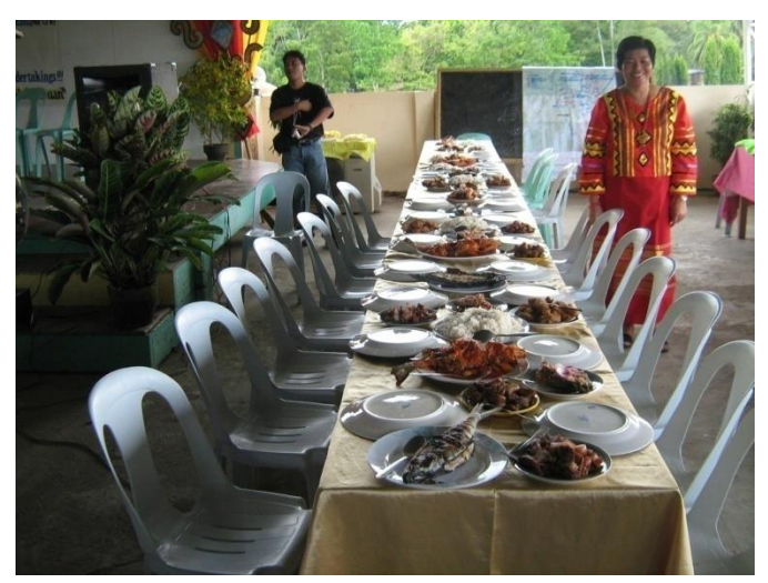
Banquet for the guest and Itribal eaders