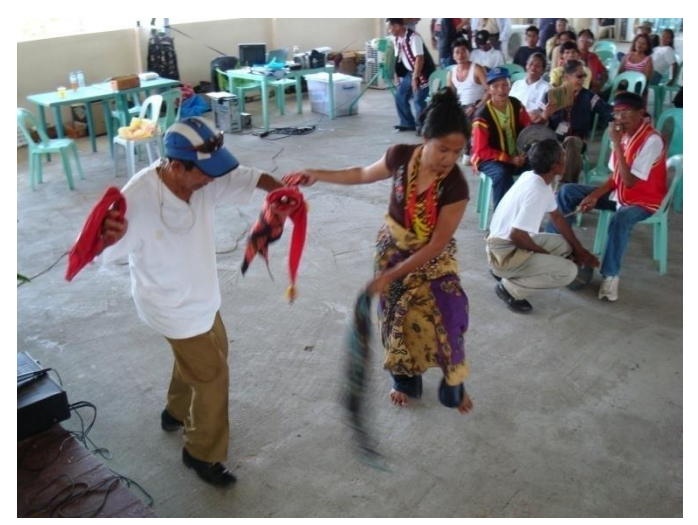
An intermission tribal dance performed by members of the tribe and of their guests.