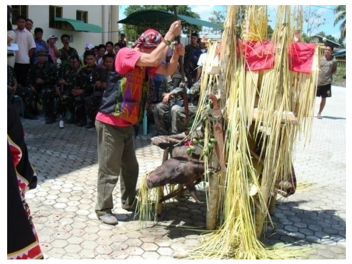
Sacrificing the pig for the sanctification of the ritual