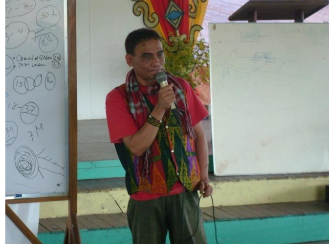
Tribal leaders speaks for their tribe