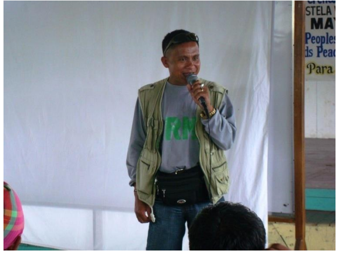
Participants share their points and thoughts during the open forum