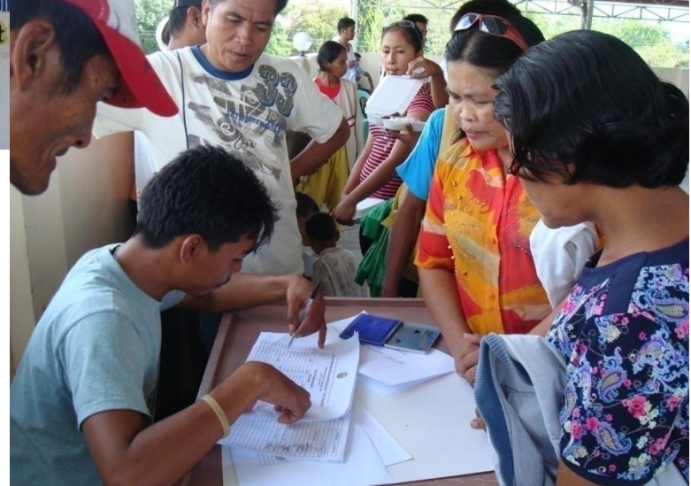
Registration for the "Kaimunan" of the Manobo-Mandaya-Dibabawon,-Mangguangan Tribal Assembly

Backdrop for the event in Poblacion, Monkayo, Compostella Valley