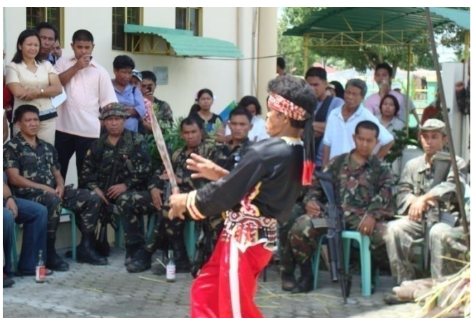
Closing part of the ritual includes tribal dancing