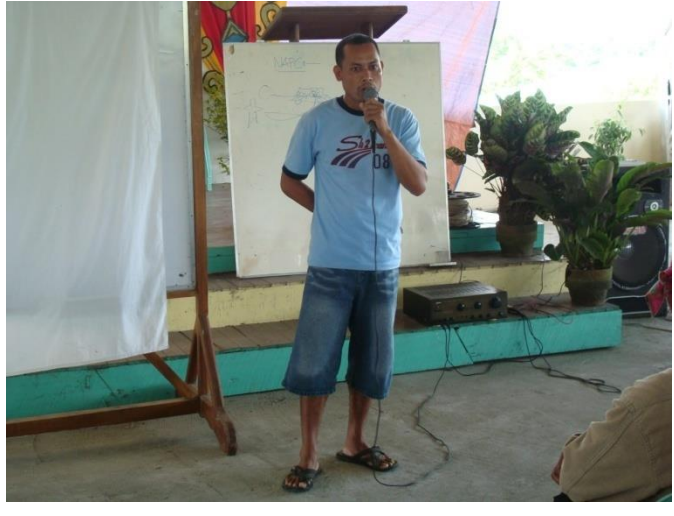
A participant spills his thoughts about