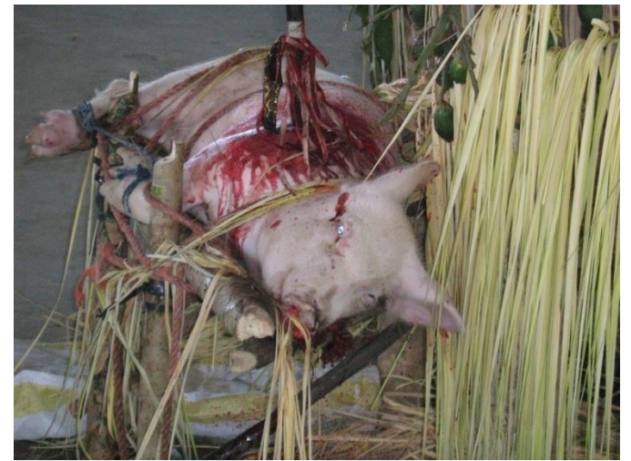
Celebrating the ritual for the "Kaimunan"