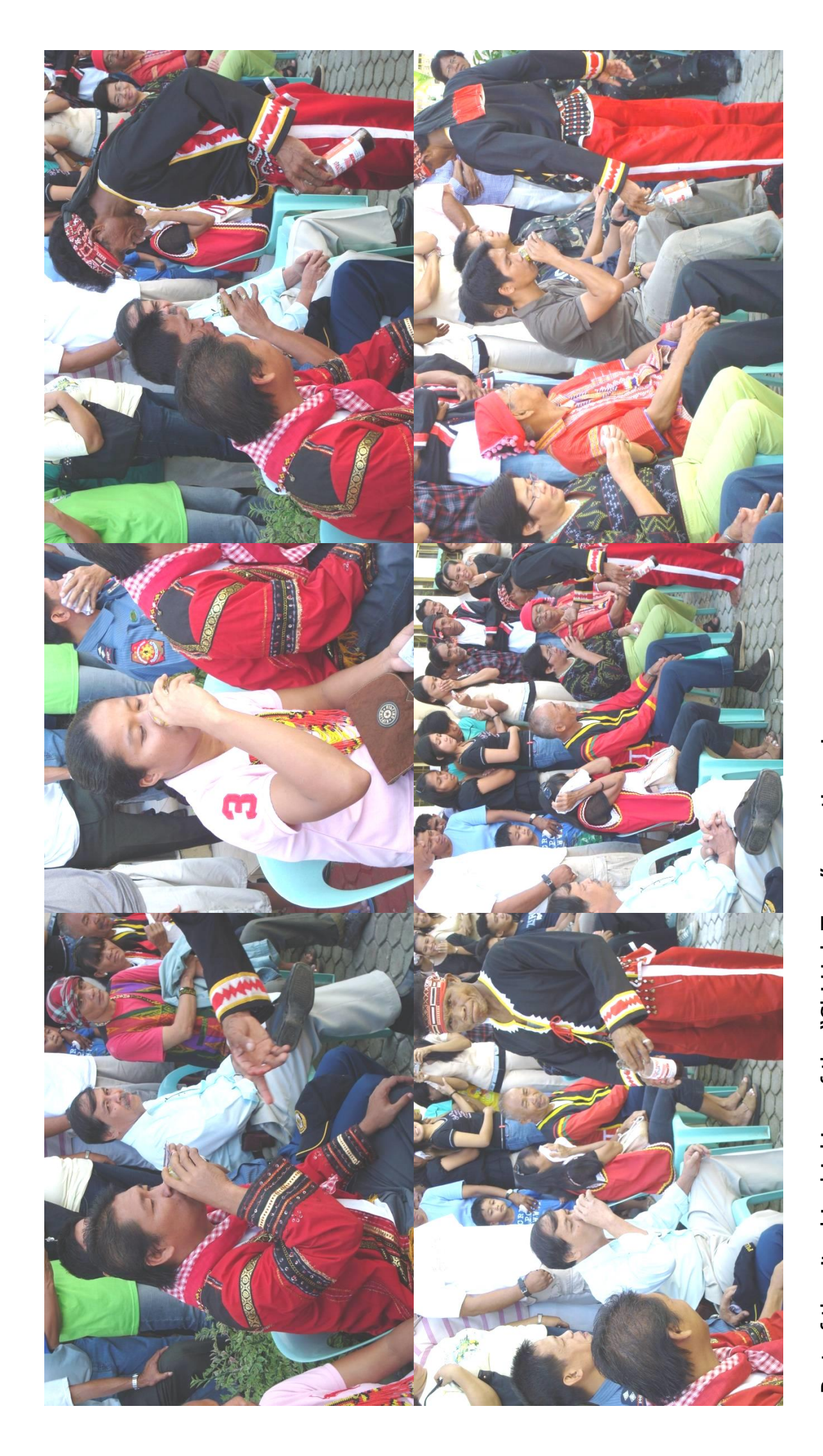
Part of the ritual is drinking of the "Shi Hok Tong" or native wine