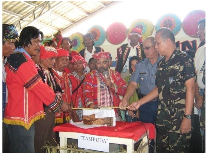
"Tampuda" or peace pact between the Manobo, Mandaya, Dibabawon, and Manguangan tribe and the AFP during the "Kaimunan"