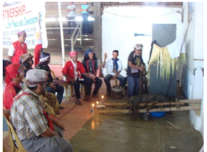
3rd day started with the opening ritual called "Pamalás"