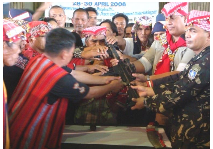
Pakang or peace pact between the Manobo of La Paz and the AFP. The Manobo tribe gave the 26IB a "sabli"; while TF "Gantangan" Commander gave his personal US-made M4 as a manifestation of the AFP's sincerity in its partnership with the IP sector.