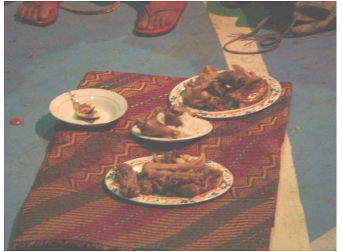
Ritual called "Pamalas"