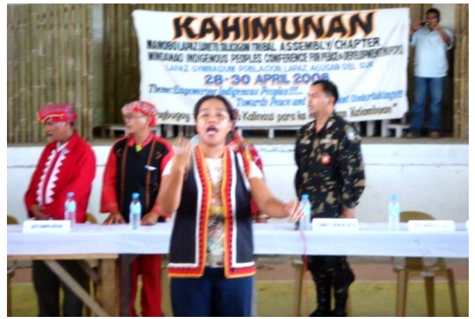
Opening prayer followed by the national anthem