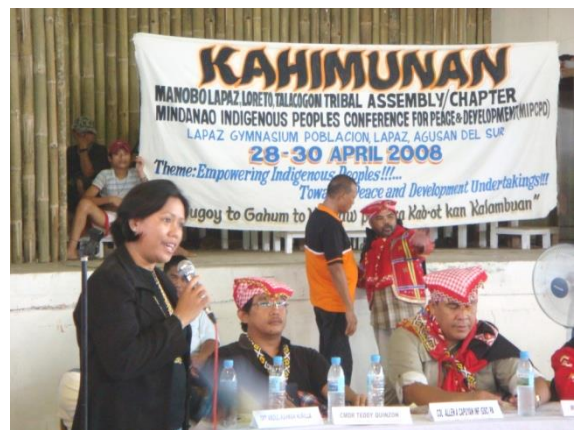
Guests from the different GLA's each gave little speeches.