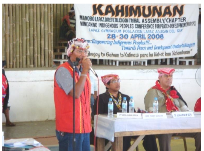
One tribal leader shares the tribe's bitter experience in the hands of the CPP-NPA.