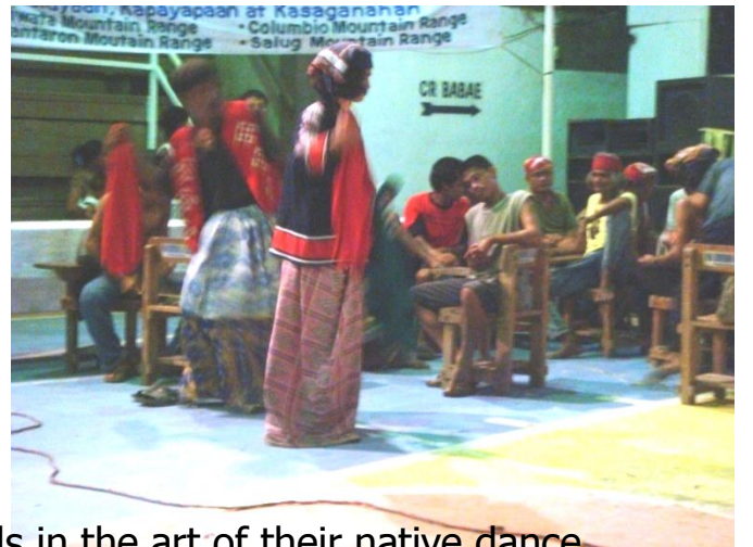
Tribal dancers displayed their skills in the art of their native dance