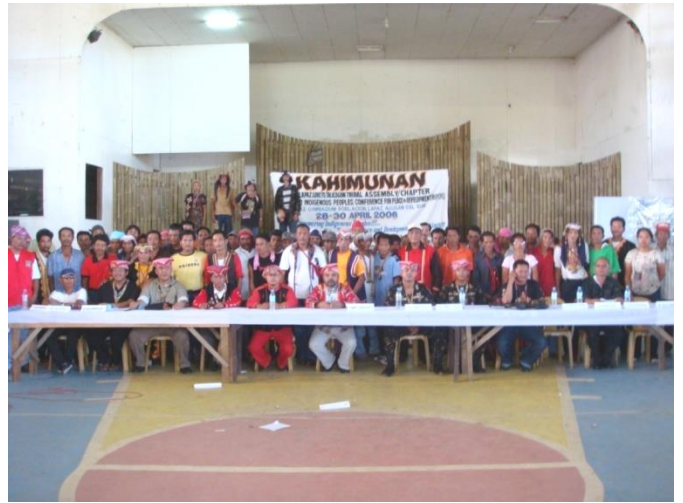
Photo Ops of all the participants with their guests.