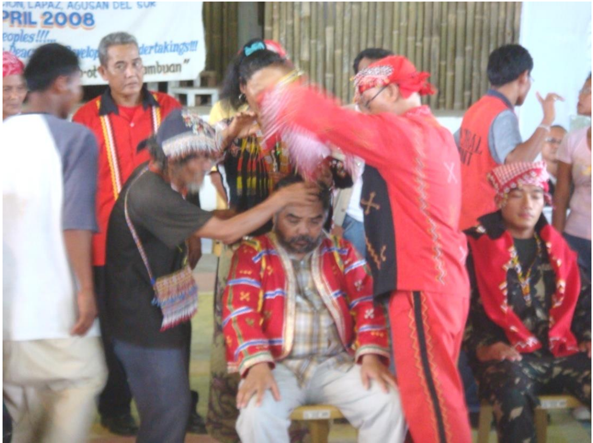
The SOT team, the AFP unit representatives and the guests from LGU/GLA were invested into the tribe.