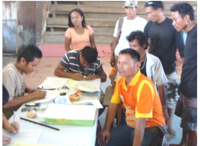
Lumads of Agusan del Sur line up for the registration