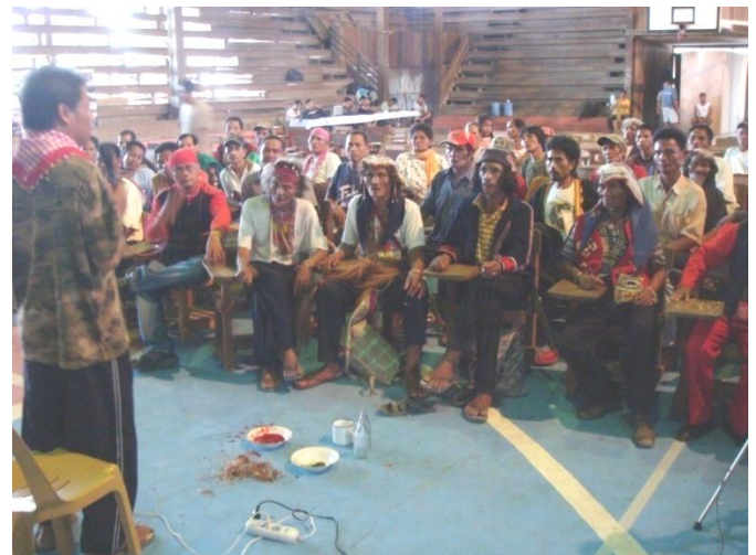
Tribal leaders and baganis alike listens intently about the topic "Knowing The Enemy"