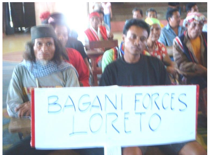
Bagani forces of Manobo, La Paz, Agusan del Sur.