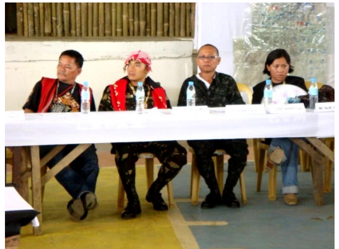
Guests (representatives from LGU/GLA and military) listen intently to the speeches given by the MIPCPD leaders.