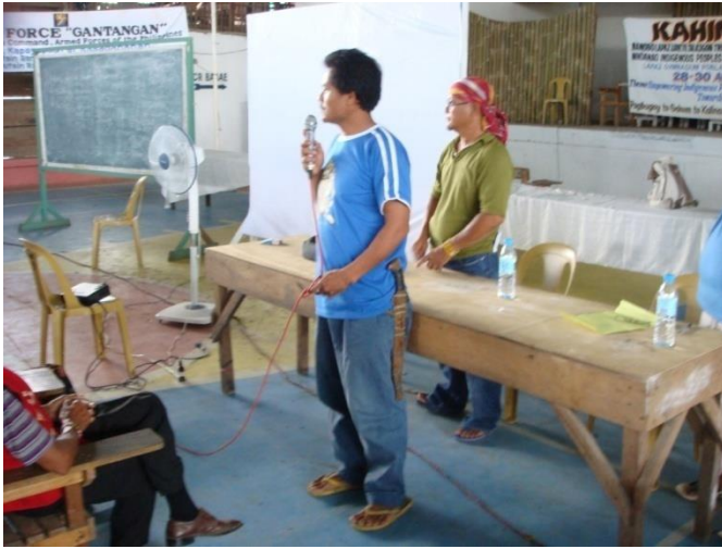
The leaders of La Paz introduce themselves