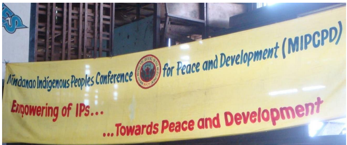
Streamers posted at the gymnasium, Poblacion La Paz , Agusan Del Sur