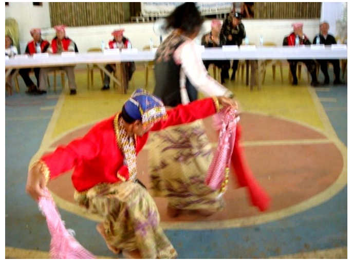
Tribal dances day 3