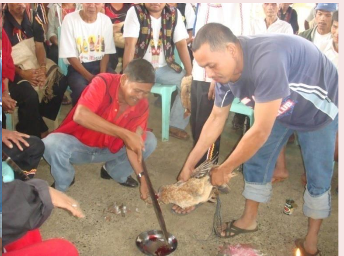
Native chicken is being offered during the Opening Ritual