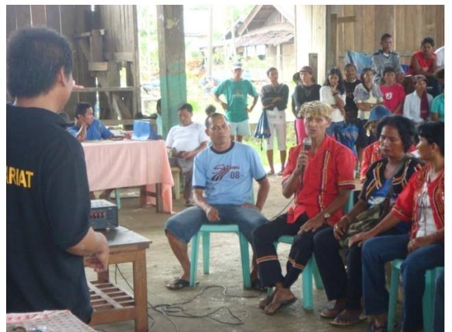
One of the Datus clarifies something with regards to TF "Gantangan"