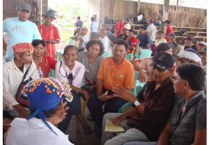
NGOs and Tribal leaders furthered their discussion in smaller groups