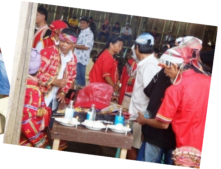
The program starts with the Panawag-tawag (opening ritual)