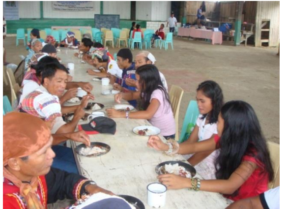
The Manobo-Banwaon tribe eat together during breakfast on the second day of the activity in San Luis