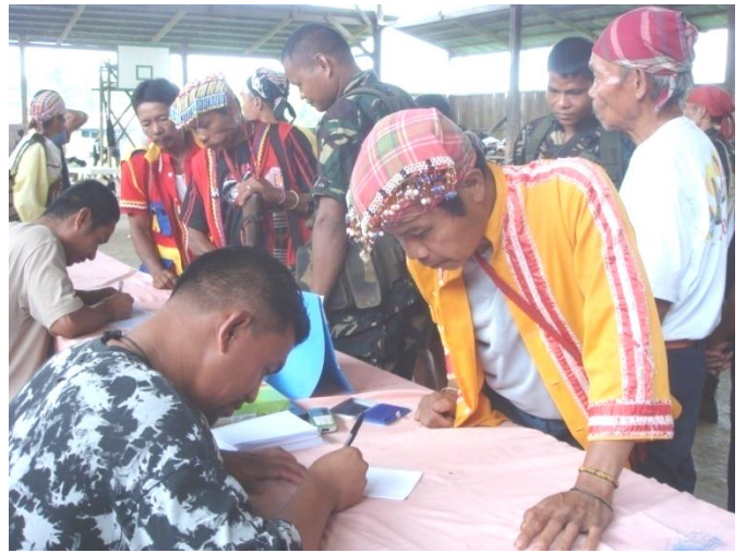
Registration starts early on the 24 th day of April 2008