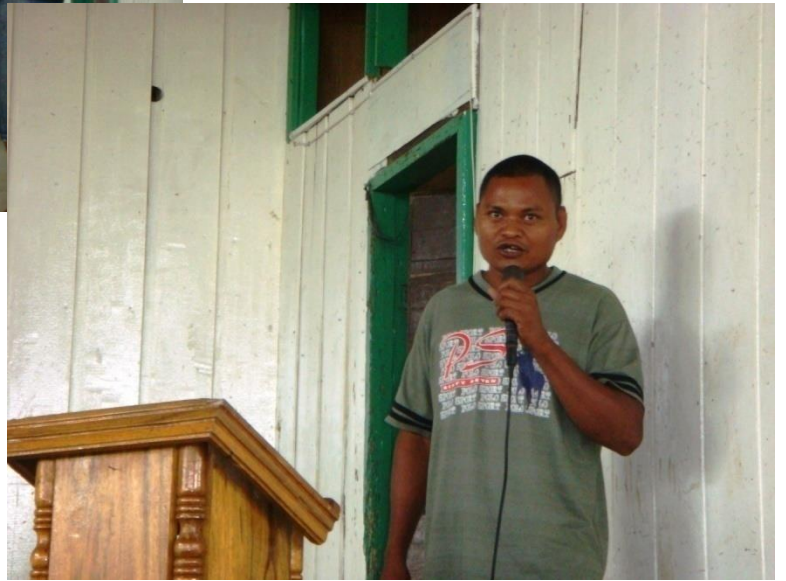
Testimonies from the victims of CPP/NPA/NDF