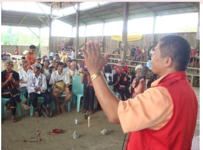
The Brgy. Capt. welcomes the participants