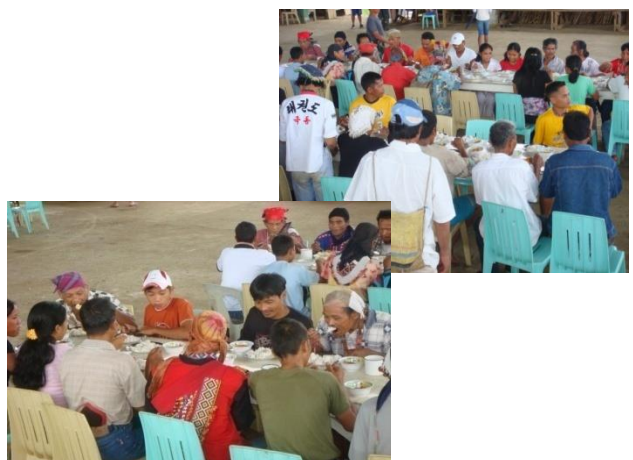
The Manobo-Banawaon share a simple but enjoyable lunch