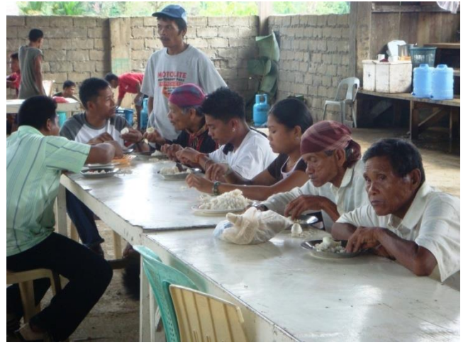
Day 3 starts with a quiet breakfast