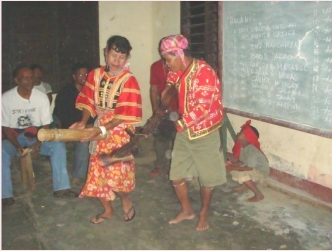
The Matigsalog tribe enjoys their tribal dance