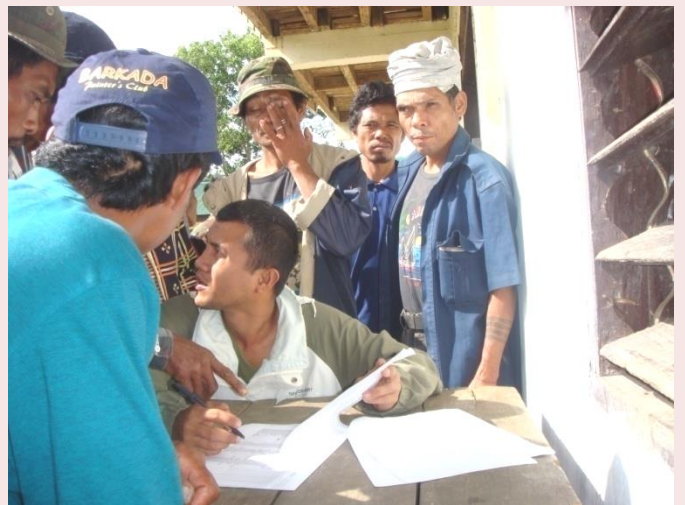
Registration for the 2 nd day