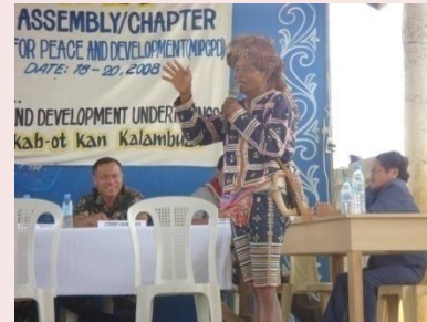
Testimony from the victims of CPP-NPA-NDF