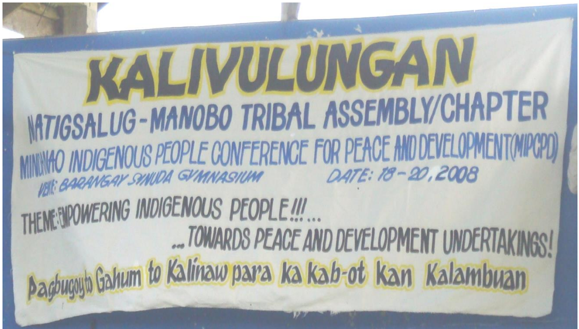
Streamers posted at Sinuda, Kitaotao