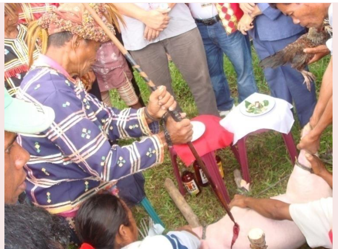
Native chickens and a pig is sacrificed during the ritual