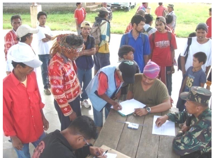
Registration begins early on the 18 th of April 2008