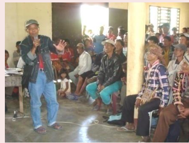
The Matigsalogs carefully listen as the history of the tribe is being discussed