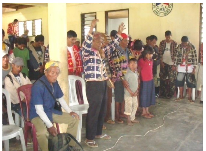
Second day of the event as they all prayed for guidance from the Lord