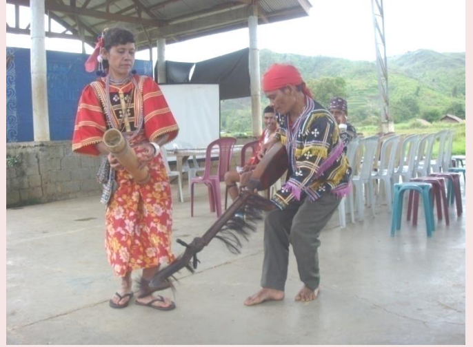
Both the Bae and the Datu practice their tribal dance