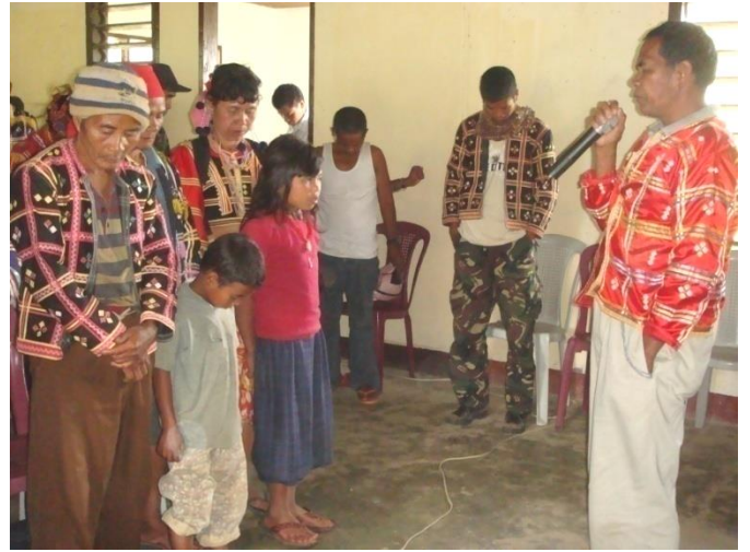
A prayer is offered after the discussion