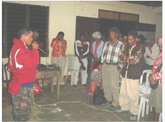
A day ended in prayer by the Matigsalogs