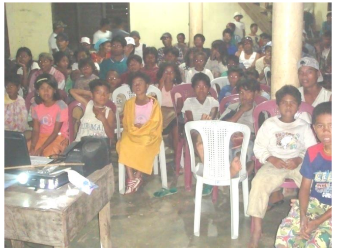
The film "Killing Fields" is shown before the night ends on the second day of the IPMPDU