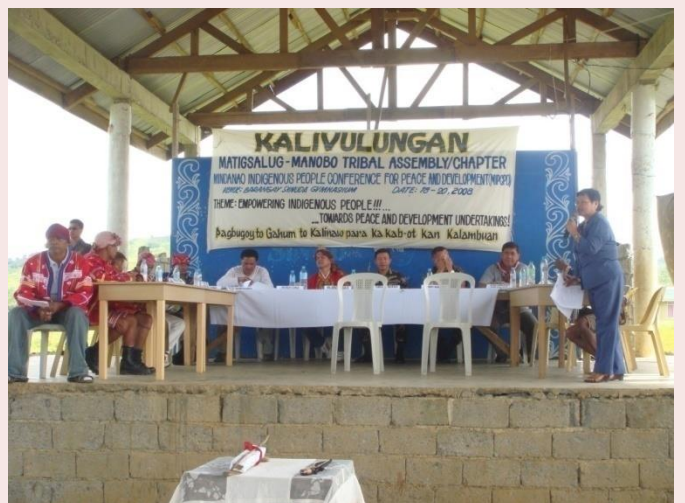
A speech is delivered by one of the guests of the "Kalivulungan"