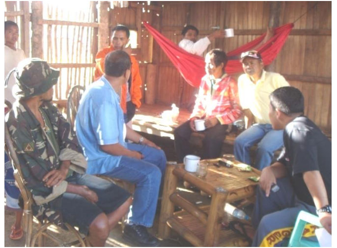
Leveling with the baganis and tribal leaders