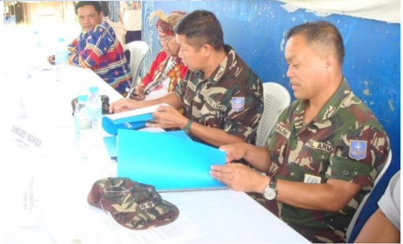
The resolutions are signed by the parties concerned