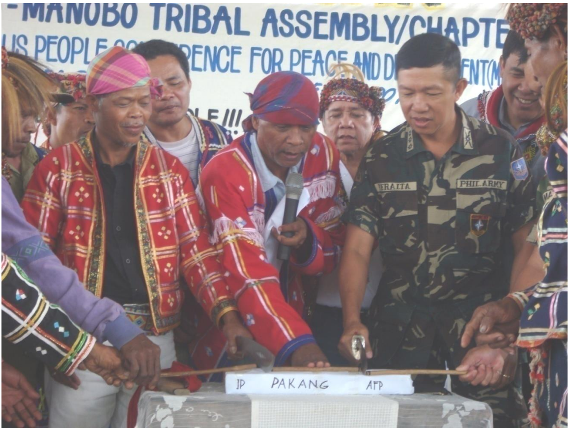
“Pakang” or peace pact between the Matigsalog-Manobo tribal assembly and the AFP