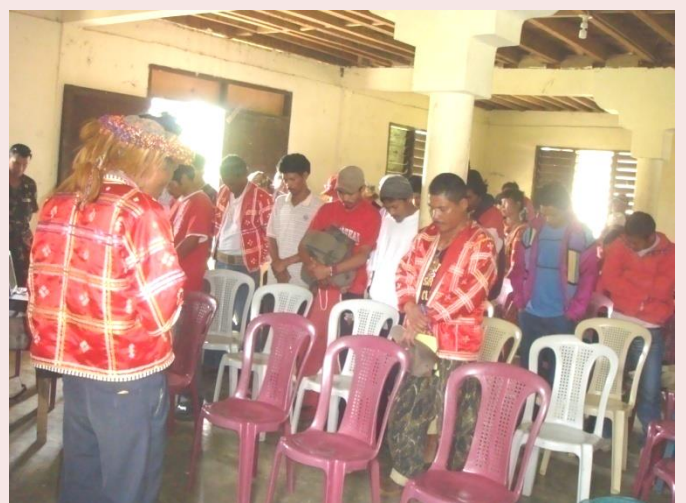
The congregation starts the program with a prayer led by the Baylan