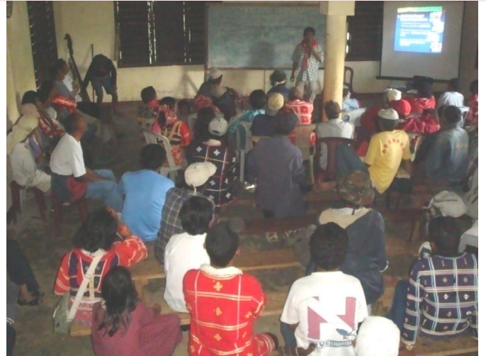
Again gathered listening keenly on the topic of "KTE"