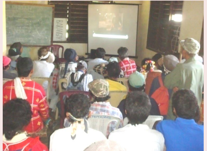
A film showing about the "Killing Fields"